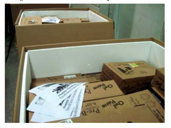
Figure 4. Triwall used for frozen products