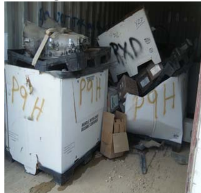
Source: 593 rd Sustainment Brigade, Container Violation Report, November 7, 2009