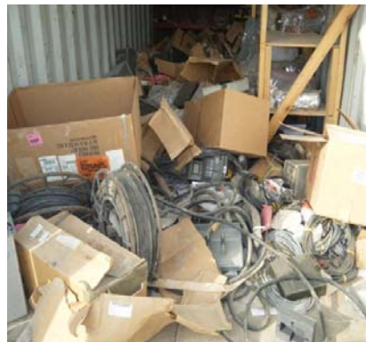
Figure 5. Unsorted Container