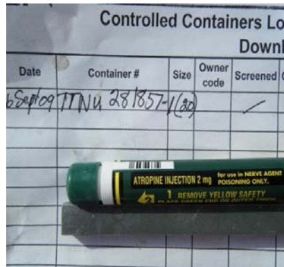
Source: 593 rd Sustainment Brigade, Offender Report, September 15, 2009