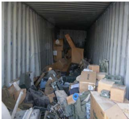
Figure 4. Unsorted Container