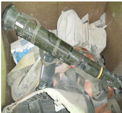
Source: 593 rd Sustainment Brigade, Offender Report, September 15, 2009