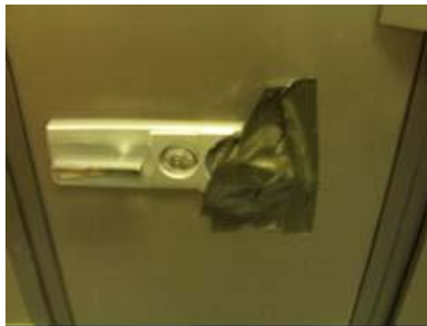
Figure 1. Example of a disabled safe combination lock

DOD FMR volume 5, chapter 3, states, “When possible, a disbursing office shall have a built-in, fire-resistant vault with at least a three-position, dial-type combination lock. The door and the vault shall be fire-resistant for a minimum period of two hours. All safes containing funds shall be stored in the vault...” Chapter 3 also states that newly constructed vaults, doors, and intrusion devices must be built or installed following the requirements of the DOD Physical Security Equipment Guide, December 2000.