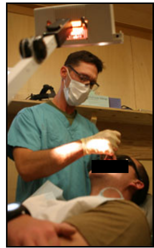
A Navy dental officer extracting a tooth from a DoD contractor in the Kandahar Province, Afghanistan