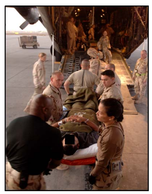
Medics carry a U.S. civilian contractor onto a C-130 Hercules in Balad, Iraq

The MTFs could have billed $141,340 for the contractor patient visits above; however, nothing was billed.