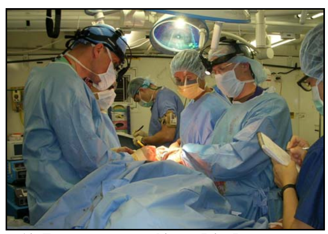
Air Force surgeons working at Joint Base Balad, Iraq

U.S. Central Command (USCENTCOM) census data for the first quarter of FY 2008 stated that there were about 223,200 contractor personnel in USCENTCOM's area of responsibility. The contractor personnel were to perform a variety of contracted services such as construction, security, vehicle maintenance and storage, and the removal of hazardous material. Contractor personnel require support, which may include the use of military billeting facilities, military post offices, military banking facilities, and medical and dental services.