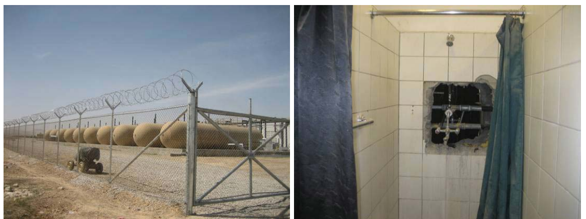
Figure E-8. Fuel Storage Tanks (left) and Frozen Pipes (right) at MeS

AED awarded Perini Corporation contract W912ER-04-D-0008, task order 0001, valued at $72.8 million, to design and construct ANA Regional Brigade in MeS. This contract included requirements to construct a prime power plant, water treatment plant, central toilet/shower facility, a centralized maintenance area, helipad, and infantry battalion complex. During our site visit, we found facilities maintenance problems, such as the formation of mold and frozen pipes. The mold at MeS is discussed in Appendix B. Figure E-8 shows fuel storage tanks and frozen pipes in showers at the Regional Brigade in MeS.