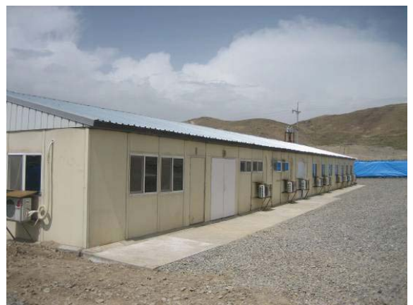
Figure E-9. Medical Living Facility

AED awarded Development Organization for Revival of Razia Sadat Afghanistan contract W917PM-08-C-0011, valued at $348,600. This contract was to design and construct a medical living facility and renovate an existing living quarters building and dining facility to house 120 personnel in Gardez. Figure E-9 shows the medical living facility in Gardez.