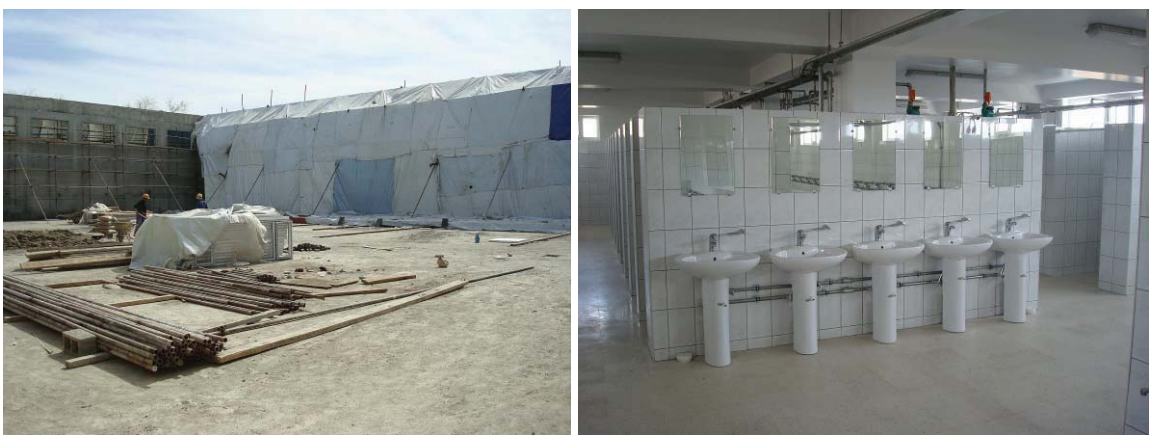
Figure E-3. NMAA Gym (left) and Latrine (right)