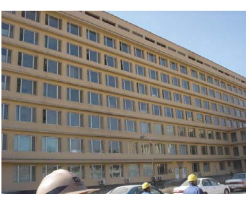
Kabul National Military Hospital

CSTC-A and AED agreed with all the recommendations. CSTC-A and AED finalized and signed the ANA program management plan and have agreed to improve planning of real property construction as required by the ANA Program Management Plan. AED will take steps to improve contract management and oversight of contractor quality control. We consider the CSTC-A and AED comments responsive.