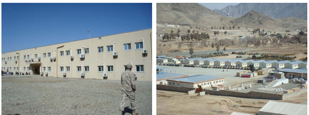
Figure E-4. Training Command Headquarters (left) and Commando Battalion Complex (right)

AED awarded Yuksel Construction Company contract W917PM-06-C-0039, valued at $2.6 million, to design and construct an ANA Training Command headquarters building at Camp Julian in Darulaman. The contract included a requirement for the headquarters building, with tea room and storage room. Also included was a parking lot. Figure E-4 shows the Training Command headquarters building and Commando Battalion Complex.