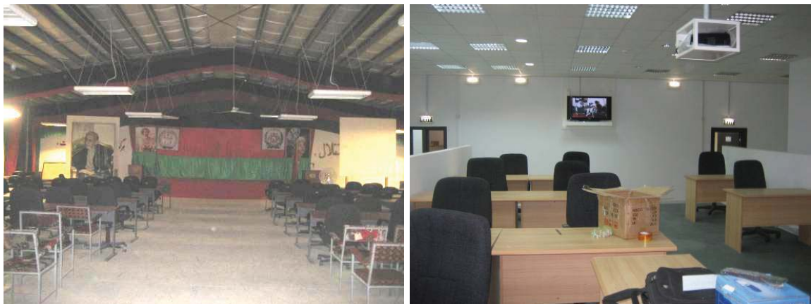
Figure E-7. Tactical Operation Center Conference Room (left) and Office (right)