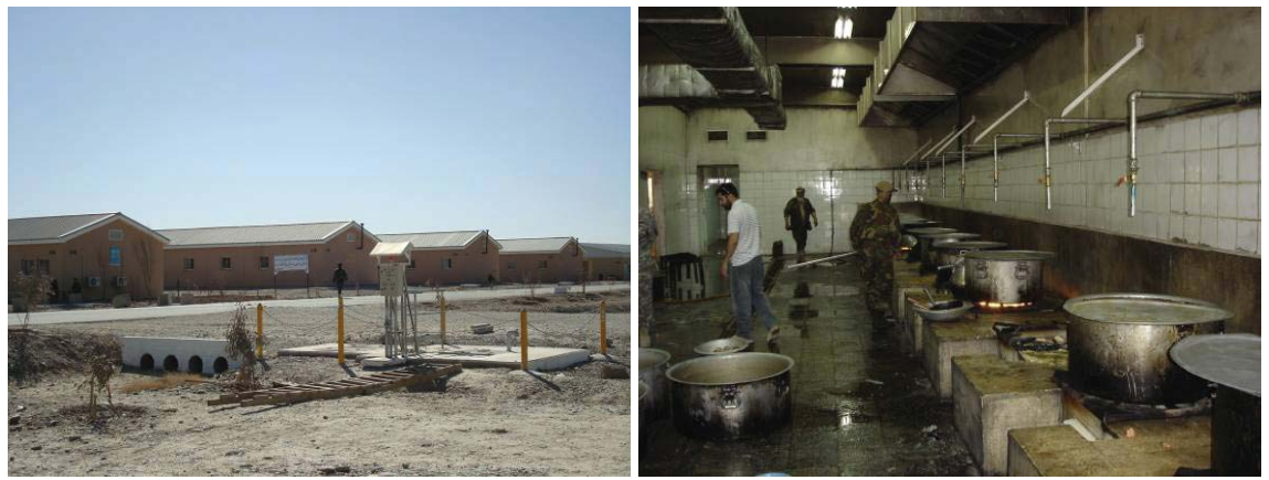
Figure E-5. Barracks (left) and Dining Facility (right)

AED awarded Contrack International Inc. contract W912ER-04-D-0003, task order 0006, valued at $67.2 million, to design and construct the ANA regional brigade in Kandahar. The regional brigade included a prime power plant, an infantry battalion complex, training building, centralized maintenance facility, barracks, and a dining facility. Figure E-5 shows facilities at the Regional Brigade in Kandahar.