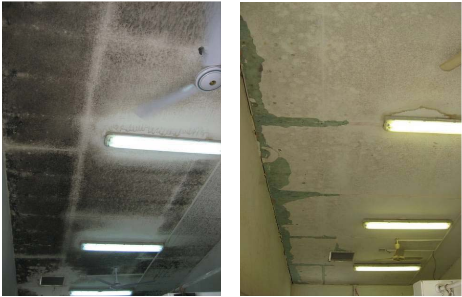
During DoD IG Visit (left) and After DoD IG Visit (right)

The figure below shows before and after pictures of mold formation at an ANA facility in MeS.