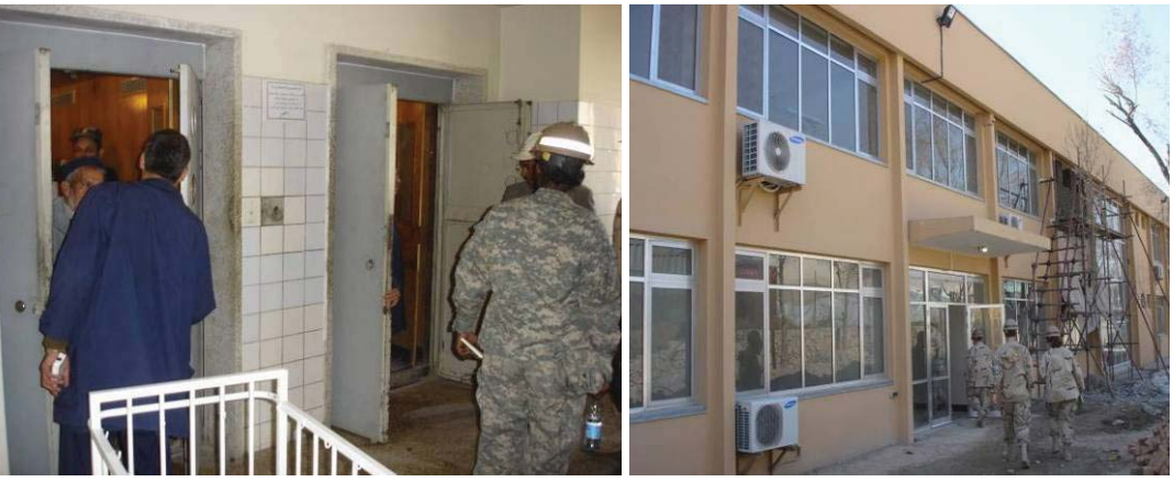
Figure E-2. Elevators (left) and Surgeon Building (right)

construction and verified the existence of the NMH. We observed the ongoing construction at NMH, including that of the elevators and surgeon building (Figure E-2).