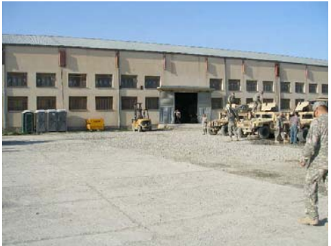
Weapons Arriving at ANA Depot 1 (left) Destined for the Warehouse (right).

Representatives of CSTC-A advised us that the Central Movement Agency transported the weapons received at Kabul International Airport to ANA Depot 1 for storage and accountability. U.S. military personnel were required to be present to supervise the receipt of these weapons at the depot. ANA Depot 1 staff compared the number of weapons received with the quantities of weapons reported on the documentation received with each shipment. However, the staff did not open the weapon crates to perform this count. Instead, they determined the quantity of weapons received by counting the total number of crates in the delivery and then multiplying the results by the number of weapons typically contained in each crate. For NATO standard weapons, ANA Depot 1 senior mentors signed a DD Form 1348 TAC-1A but did not return the documents to the U.S. Army Security Assistance Command as receipt feedback.