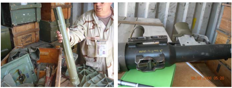
Figure 1. Weapons Housed at ANA Depot 1

review of policies and procedures for handling weapons and conducted an inventory of weapons stored at ANA Depot 1 in June 2008 (See Figure 1). CSTC-A took corrective action based on our initial audit results. The Munitions Assessment Team visited Afghanistan during March 2009 following up on the prior DoD Inspector General and GAO recommendations, assessing the status of weapon accountability in Afghanistan. The results of that review will be published in July 2009.