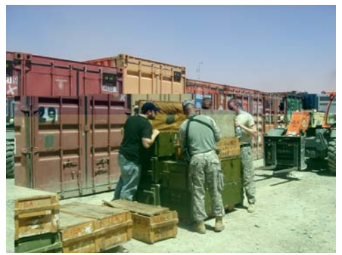
Figure 3. Auditor Counts Weapons at ANA Depot 1

weapon categories. Because the baseline inventory levels for the weapon categories were incorrect, future bulk inventory levels in the inventory management system will be misstated if not adjusted.