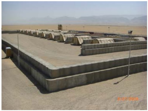
Figure 4. Ammunition Supply Points in Herat (left) and Mazar-e-Sharif (right) Lack Security Fencing Around the Perimeter