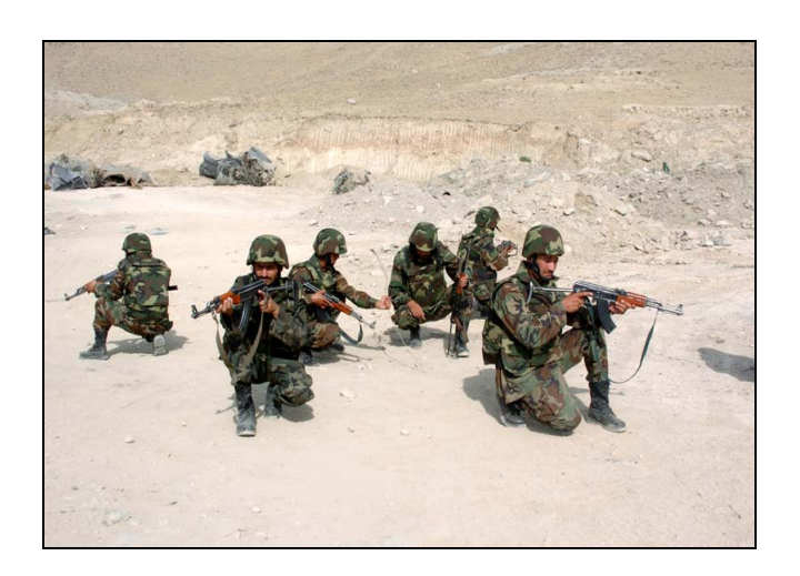
Afghan National Army Soldiers Perform Training Exercises

No written response to this report was required, and none was received. Therefore, we are publishing this report in final form.