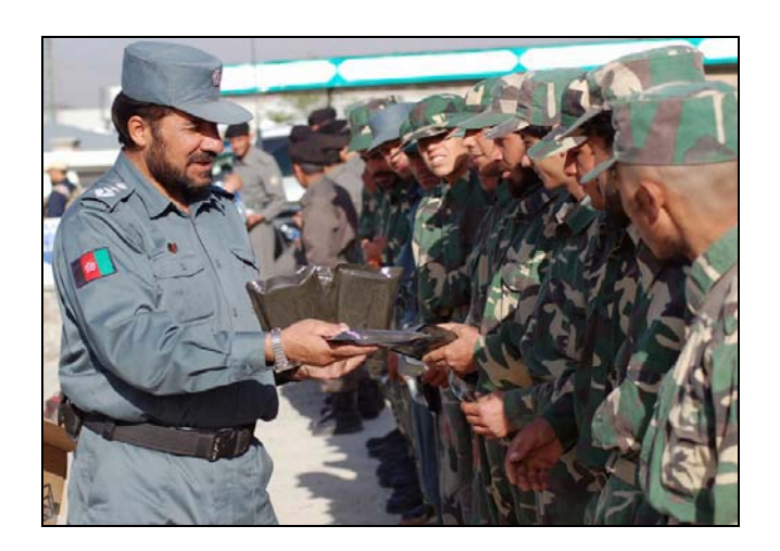
Afghan National Police Members Distribute Supplies