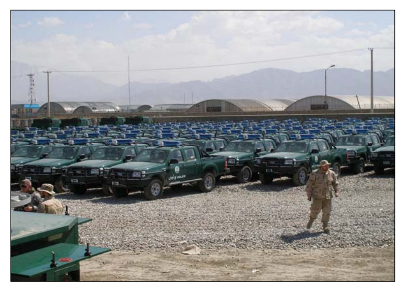
Figure 3. Light Tactical Vehicles Prepared for Delivery to the ANP in Kabul, Afghanistan

Public Law 109-234 provided the ASF funds to acquire the 6,442 vehicles. Congress designated the amount appropriated in the ASF Fund in Public Law 109-234 as an emergency requirement. In addition, providing the vehicles to the ANP should advance U.S. National Security goals of helping Afghanistan become stable, democratic, and free of terrorists. Figure 3 shows some of the 4-door light pickup trucks requested by CSTC-A, acquired by TACOM LCMC, and awaiting delivery to the ANP.