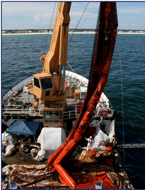
U.S. Coast Guard Seagoing Buoy Tender Aspen, homeported in San Francisco, recovers fast sweep boom June 28 after oil skimming operations in the Gulf of Mexico less than one mile from the shoreline. The Aspen is one of several Coast Guard vessels skimming oil in the Gulf of Mexico as part of the ongoing effort to combat the Deepwater Horizon oil spill.

equipment as well as their landing craft and small boats, they're in the thick of the battle down there."