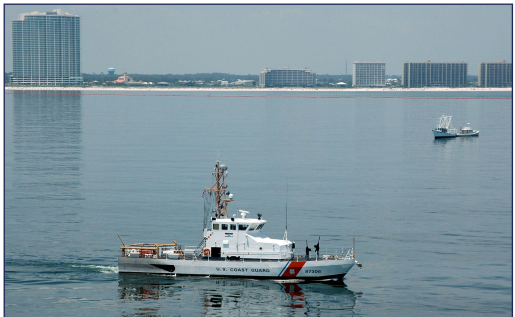
The crew of U.S. Coast Guard Cutter Stringray, an 87-foot Coastal Patrol Boat homeported in Mobile, Ala., works with a Vessel of Opportunity off the coast of Gulf Shores, Ala., June 13 to spot oil and review booming operations as part of the Deepwater Horizon oil spill response effort. The Vessels of Opportunity program offers local boat operators an opportunity to assist with oil spill response activities.