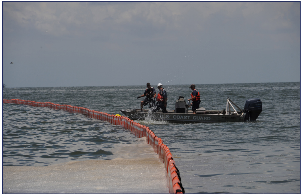
U.S. Coast Guard Buoy Tender Axe crewmembers and civilians set boom June 16 along the northeast shoreline of Racoon Island, approximately 20 miles south of Cocodrie, La. Racoon Island is a protected bird breeding sanctuary with a variety of breeds. The Axe is a 75-foot construction buoy tender homeported in Morgan City, La.

The RDC has a subject matter expert onsite who is reporting to the Incident Commander for Surface Response and providing guidance on in situ burns, dispersants and sorbent boom use.