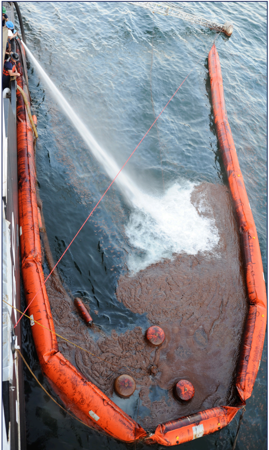
The crew of U.S. Coast Guard Seagoing Buoy Tender Juniper use the on-board fire hose from the buoy deck June 13 to direct surface oil collected into the Shipboard Oil-Recovery System pump. Crewmembers of the 225-foot Juniper, homeported in Newport, R.I., are conducting oil-skimming operations off the Alabama and Florida coasts in addition to the crews of Juniper-class seagoing buoy tenders Oak, Cypress and Elm.