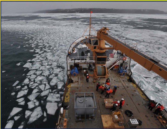
Coast Guard Cutter Hollyhock from Port Huron, Mich., breaks ice near Mackinac Island to support the Research and Development Center's tests of techniques for removing oil from ice.

The helix skimmer is efficient at removing oil without taking up water and ice with it. The Coast Guard also showed that existing fire boom technology could successfully move a section of ice away from a larger patch to burn any oil contained in it.