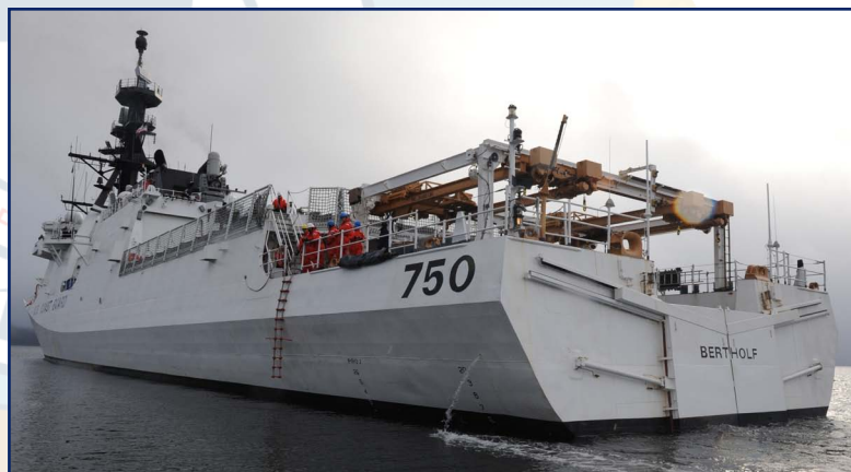
The Coast Guard Cutter Bertholf's name is visible on the stern as the crew prepares to navigate the ship through the Gastineau Channel prior to mooring at Juneau, Alaska, in April 2011.

Naming new cutters is a responsibility that the Coast Guard takes very seriously and decisions are not made quickly, nor without great thought and consideration. If you have a recommendation, I highly suggest you provide as much detail as possible in your proposal to assist the board and the Historian's Office in researching your suggestion.