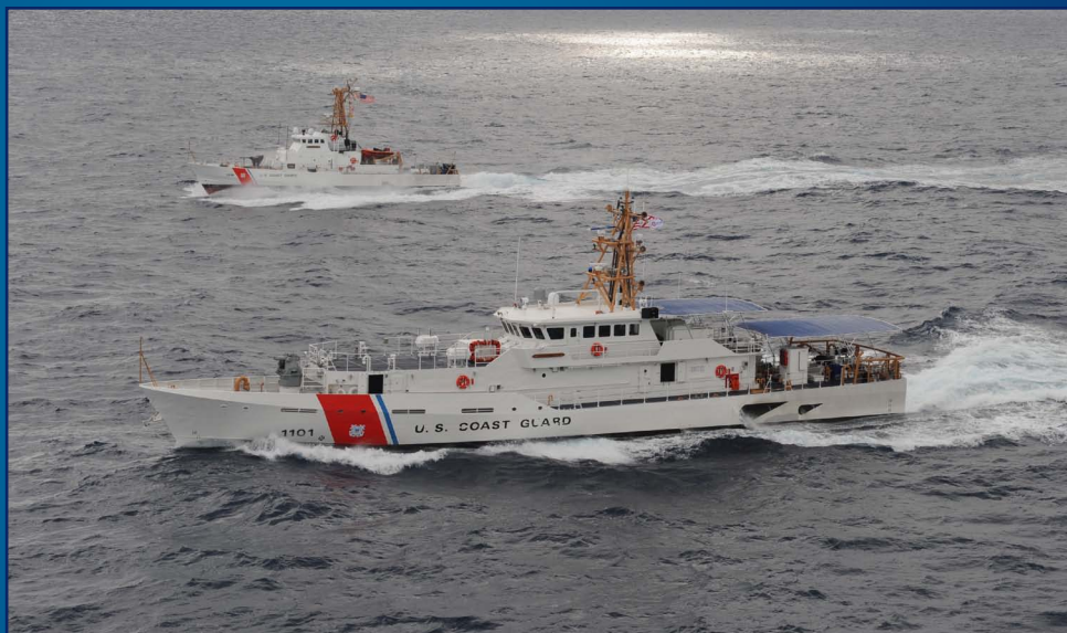
The Coast Guard Cutter Nantucket, a legacy 110-foot patrol boat, keeps pace with the Coast Guard's newest Fast Response Cutter, the Bernard C. Webber, during its arrival at Sector Miami on Feb. 9.

Bollinger Shipyards of Lockport is building the 154-foot Sentinel-class FRC to replace the 110-foot