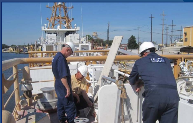
Coast Guard engineers from the Project Resident Office assess the shipbuilder's progress in constructing a Fast Response Cutter hull at Bollinger Shipyards in Lockport, La.

drawings, calculations, technical manuals, supply support and training. All of these efforts ensure that new FRCs are delivered to the Coast Guard according to contract specifications.