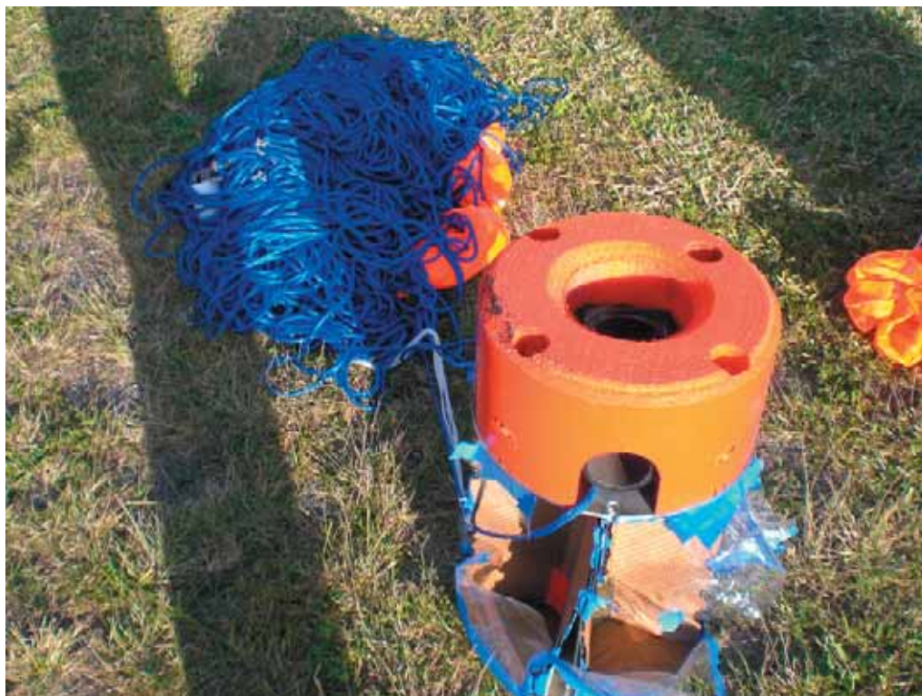
Boat Trap is a running gear entanglement system capable of fouling the propellers of boats traveling in excess of 30 knots. Potential applications of the device include port security and the interdiction of illegal drug smugglers.

The Boat Trap and IMS multi-mode detection devices are just two examples of the progressive technologies being developed to help the Coast Guard to conduct