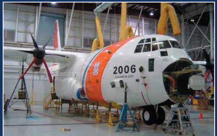
HC-130J undergoing missionization

In February, the fifth of six Coast Guard HC-130J long range surveillance aircraft will begin a process of "missionization" at Lockheed Martin's Greenville, S.C. facility. The missionization project uses common technologies with those of the new HC-144A Ocean Sentry medium range surveillance aircraft. The HC-130J missionization adds new equipment, including a surface search radar, a forward-looking infrared (FLIR)/electro-optical sensor, satellite and emergency response radios, and modernizes the aircraft flight deck operator's station. In November, the Coast Guard exercised contract options for the missionization of the last two HC-130Js. When completed, the aircraft will join the others stationed at Elizabeth City, N.C.