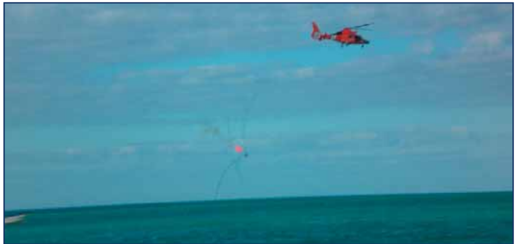
Boat Trap can be deployed from Coast Guard helicopters in flight. Recently, the R&D Center and the Department of Homeland Security's Science and Technology Directorate successfully demonstrated Boat Trap against a 33-foot speed boat powered by twin 200 horsepower motors.