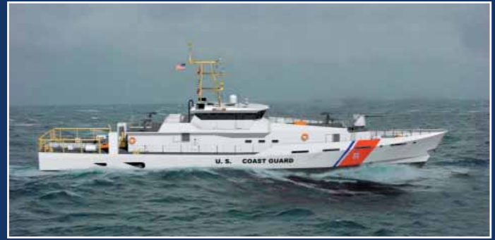
Bollinger Shipyards' artist conception of the Sentinel

The Sentinel-class patrol boat acquisition is set to move forward following a ruling by the Government Accountability Office (GAO) that upheld the Coast Guard's decision to award the project's contract to Bollinger Shipyards, Inc., of Lockport, La. In 2011, the Coast Guard plans to take delivery of a lead vessel, which will support operational test and evaluation of the Sentinel-class. The Sentinel is one of three new classes of vessels (including the National Security Cutter and the Offshore Patrol Cutter) that will modernize the Coast Guard's cutter force.