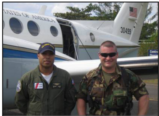
Coast Guard personnel from the Defense Attache Office Bogota prepare to depart on the embassy's C-12.

Coast Guard intelligence components represent Coast Guard interests within the IC, and on intelligence matters within the Department of Homeland Security,