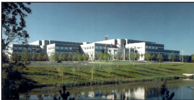
The National Maritime Intelligence Center, located in Suitland, Md.

Intelligence must have an effective presence in the field. The Coast Guard maintains this through District and Sector Intelligence Staffs, Command Intelligence Officers, Coast Guard Investigative Service Special Agents, and deployed intelligence officers and specialists. Coast Guard commands collect and report intelligence and other information in the port and coastal areas, where other organizations have limited capability.