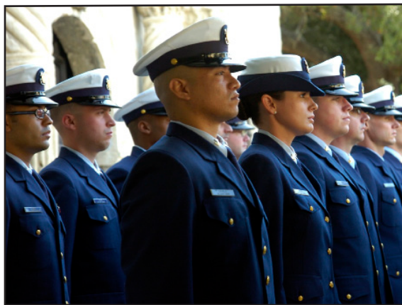
The crew of Coast Guard Cryptologic Unit Texas during commissioning ceremony at the Alamo.

The Coast Guard's National Intelligence Element - The National Intelligence Element (NIE) consists of ONLY those intelligence components and billets designated by the Assistant Commandant for Intelligence and Criminal Investigations, Commandant (CG-2), as IC resources as established under the