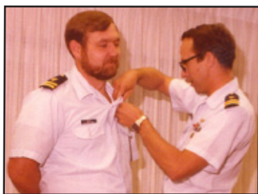
Former Coast Guard Commandant Thad Allen, then Lt. Allen, receives an award after serving at the El Paso Intelligence Center.

were created to facilitate information sharing and the contributions of Coast Guard maritime expertise. More robust intelligence support to Coast Guard