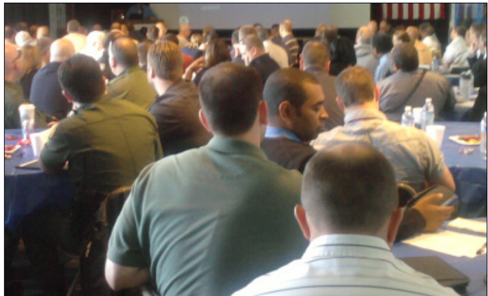
Sector Detroit intelligence staff host a conference for international, national, state, local, and tribal intelligence and law enforcement partners.

In addition to working with other members of the IC to meet national intelligence requirements, Coast Guard intelligence personnel also interact regularly with other national, regional, state, local, and tribal law enforcement and intelligence entities. These include Joint Terrorism Task Forces (JTTFs), and State and Local Fusion Centers.