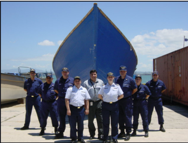
Intelligence staff in front of a seized 41 foot "super yola" in San Juan, Puerto Rico, after the vessel was interdicted in the Mona Pass with 245 nationals from the Dominican Republic on board.

Sector Intelligence Staff (Si) - The Sector Intelligence Staff performs each phase of the intelligence cycle to varying degrees. It supports the Sector Commander, provides value added information for reports produced within the Sector, sensitizes operations personnel to intelligence priorities and collections requirements, performs law enforcement intelligence collection, and serves as collection manager for the assets in the Sector. It defines and meets the Sector Commander's intelligence needs, provides guidance and oversight to Command Intelligence Officers, serves as the conduit for production and requirements flowing in and out of the Sector, and consists of subject matter experts on maritime adversaries and the means in