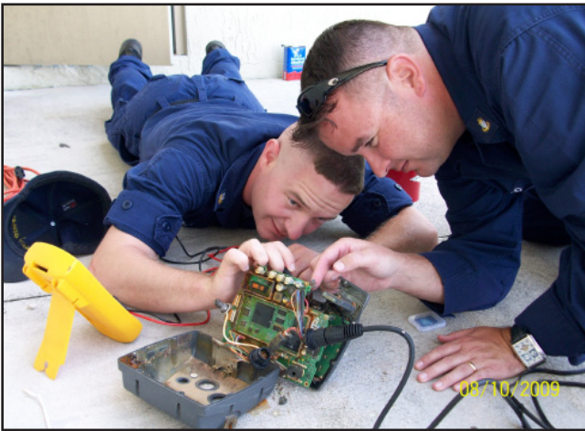
Seventh District Intelligence Specialists perform digital forensics on a GPS receiver to help the Florida Fish and Wildlife Conservation Commission in a boating fatality accident investigation.