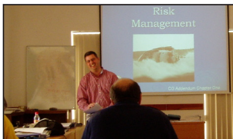
USCG Attache instructing international partners on Risk Management.

The obligation to ensure that personnel engaged in intelligence duties or activities are properly trained, equipped, and sustained for the mission, and that appropriate security measures are implemented to protect classified information, sensitive-but-unclassified information, and intelligence sources and methods from unauthorized disclosure.