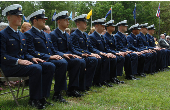
Graduates of the first Intelligence Specialist 'A' School at TRACEN Yorktown.

the detection and interdictions of foreign fishing vessels in the U.S. Exclusive Economic Zone and those in violation of international fishing protocols.