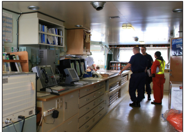
Sector Boston intelligence staff conduct a consent-based interview on a visiting motor vessel.

Coast Guard HUMINT activities include domestic information gathering for situational awareness and against criminal adversaries. The vast majority of these activities involve overt observations and interactions made under Coast Guard law enforcement and regulatory authority, activities which align under a