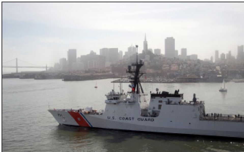
USCGC Waesche (WMSL-751), one of the new National Security Class cutters, has organic intelligence components.

The Coast Guard creates and maintains a rigorous oversight function to ensure compliance. Coast Guard commands should conduct regular internal review and welcome external oversight.