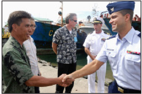
An Intelligence Officer from the Fourteenth District meets foreign dignitaries in Pohnpei, Federated States of Micronesia, during a Law Enforcement Roundup.

Coast Guard operating forces, especially those assigned to response and prevention functions, have unique access and expertise in the maritime domain. Typically, these operating forces are better positioned to collect information of potential intelligence value than are the comparatively smaller number of intelligence personnel. Therefore, a primary responsibility of intelligence staffs is to sensitize their operational counterparts to collection opportunities and requirements. Armed with this knowledge, every single Guardian is capable of observing and reporting information that may be valuable to executing the Coast Guard's missions: "Every Guardian is a sensor."