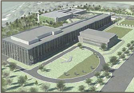
Intelligence Community Campus - Bethesda (1)