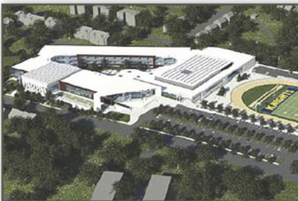
Ballou Senior High School (3)