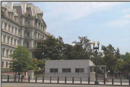
Eisenhower Executive Office Building (2)