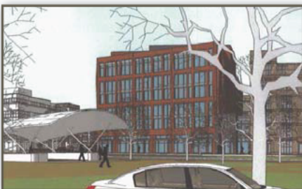
Square 901 (4)