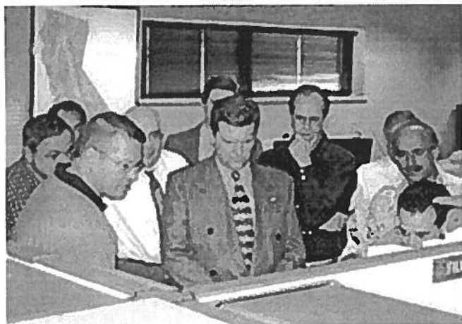
Area media representatives get a first-hand look at WFO technology.

On October 16, the 8th annual media seminar conducted by WFO San Joaquin Valley drew eight major affiliate TV stations in the Fresno and Bakersfield mar-