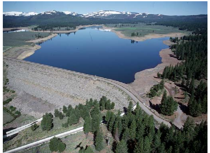
Prosser Creek Dam and Reservoir

Prosser Creek Dam and Reservoir are located on Prosser Creek approximately 1.5 miles above the confluence of Prosser Creek and the Truckee River. The dam is a zoned earthfill structure, and the reservoir has a capacity of 29,800 acre-feet. Up to 20,000 acre-feet of this amount is required for flood control purposes from November through June. Water stored in the reservoir is used in an exchange of releases with Lake Tahoe to improve fishery flows in the Truckee River.