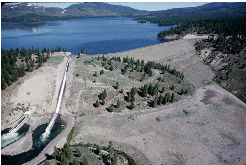
Stampede Dam and Reservoir