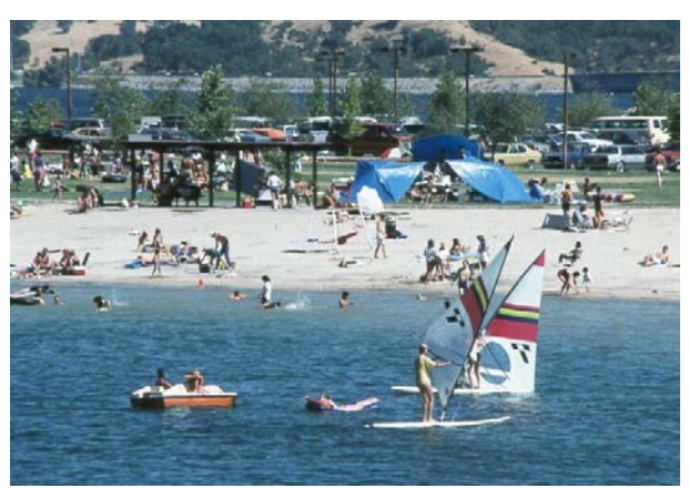
Recreational activities at Reclamation Reservoirs

The Mid-Pacific Region has 41 recreation and wildlife areas including reservoirs, fishing access sites, trails, fish hatcheries, and wildlife management areas. Of these, 22 are managed by non-federal partners such as the California Department of Parks, the Nevada Division of State Parks, the California Department of Fish and Game and various county, city and local entities. Of the remaining, 13 areas are managed by federal partners, including the Shasta National Recreation Area (NRA) by the U.S. Forest Service and the Whiskeytown NRA by the National Park Service. Reclamation directly manages 6 recreational areas within the Region listed below: