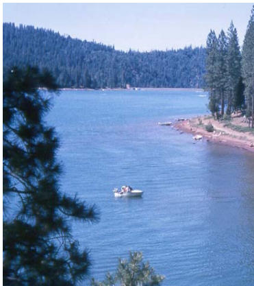
Boating in Shasta Reservoir

The Mid-Pacific Region currently employs about 1000 people in a wide range of positions from park ranger to engineer to administrative assistant to fishery biologist. Project managers take the lead in negotiating contracts, implementing habitat improvements and furthering ongoing projects. Operations and maintenance personnel manage and maintain critical facilities in drought and flood conditions, monitor facilities instrumentation, perform preventive maintenance and oversee rehabilitation and repair projects. Support staff provides the design, engineering, construction, data processing, human resources, procurement, budget, and other services essential to getting the job done.