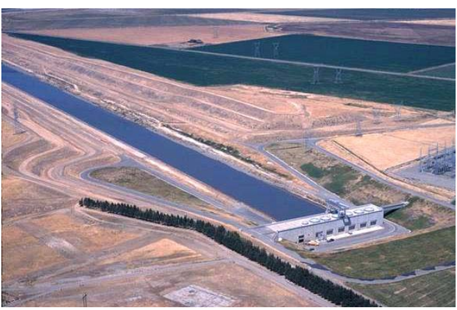
Sacramento - San Joaquin Delta

The plant is located near the Tracy Fish Collection Facility, which diverts threatened and endangered fish away from the pumps to meet regulatory requirements. As long as the fish facility is in operation, the pumps can operate.