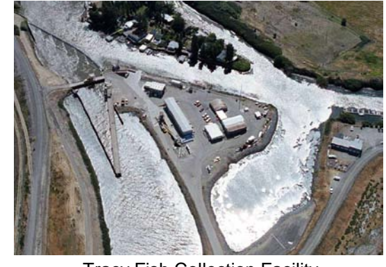
Tracy Fish Collection Facility

collected at the facility, including listed species such as the Delta smelt, winter-run and spring-run Chinook salmon, steelhead, and green sturgeon.