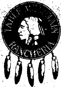
TABLE MOUNTAIN RANCHERIA