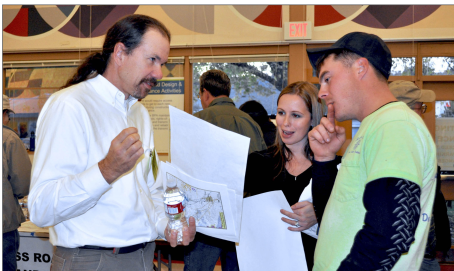
Public meeting in Camas, Wash.