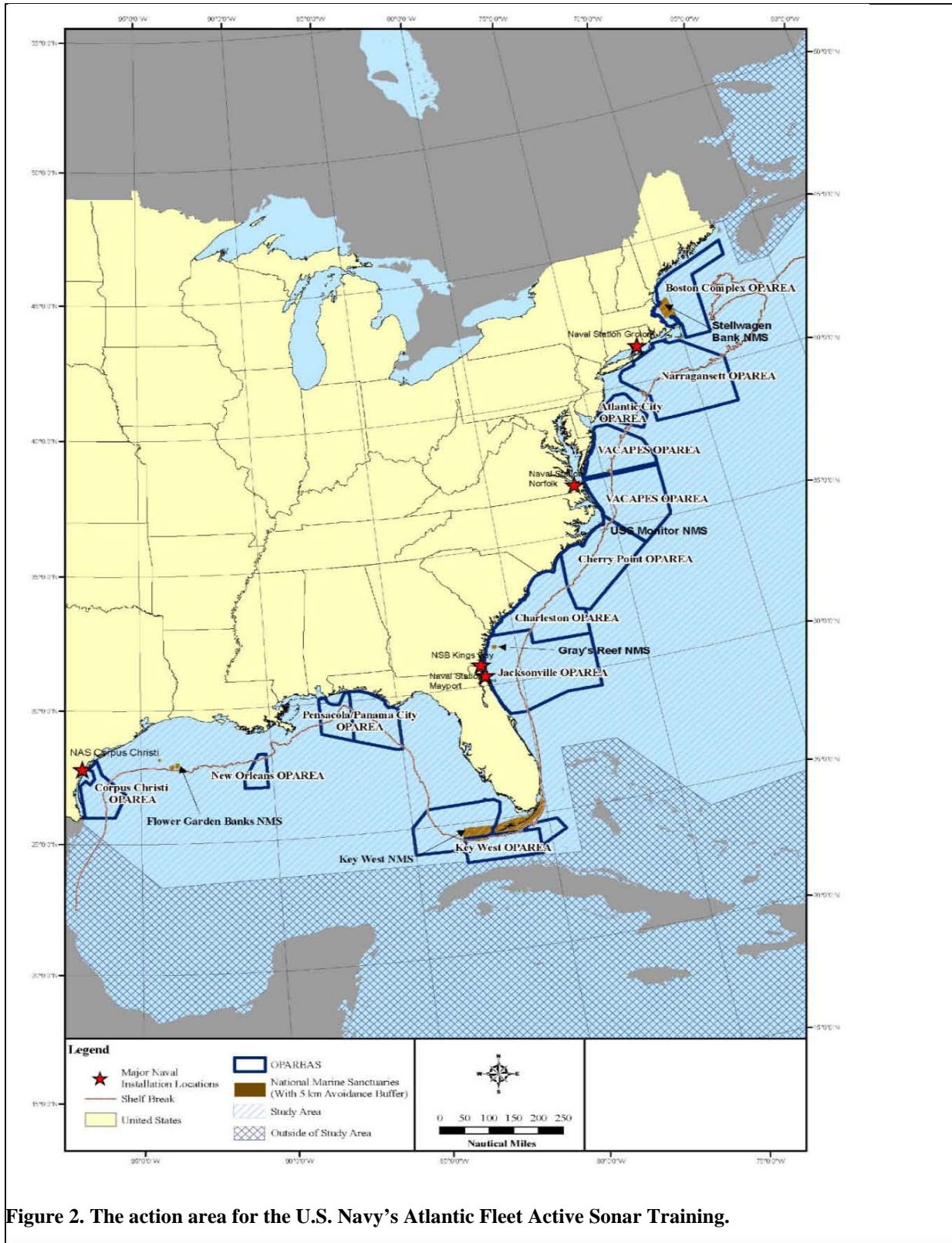
Figure 2. The action area for the U.S. Navy’s Atlantic Fleet Active Sonar Training.