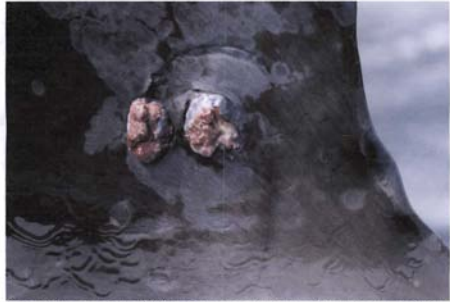
Fig. 4 b. Close-up view of T99A exit wounds at barb sites, illustrating extent of tissue extrusion. The open wound does not appear to be infected.