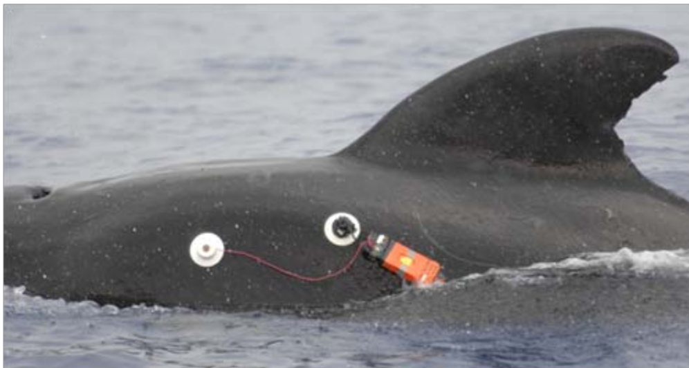
Figure 4. ECG tag attached to pilot whale off the Kona coast of Hawai'i.