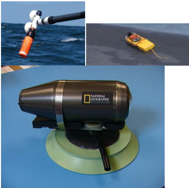
Figure 1. Examples of various suction cup tags deployed off the US West Coast in past research by applicant. Top left is a Bprobe with floatation Top right is the MK10 Fastlock GPS tag, and at bottom is a National Geographic Crittercam (this is an older version, current V3 is smaller).