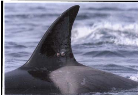
Fig. 4 a. Transient ecotype killer whale T99A thirty-five days after tagging and two days after tag transmission ceased, illustrating fresh exit wounds at barb sites.