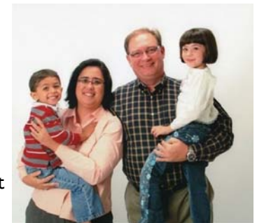
The Worthington Family