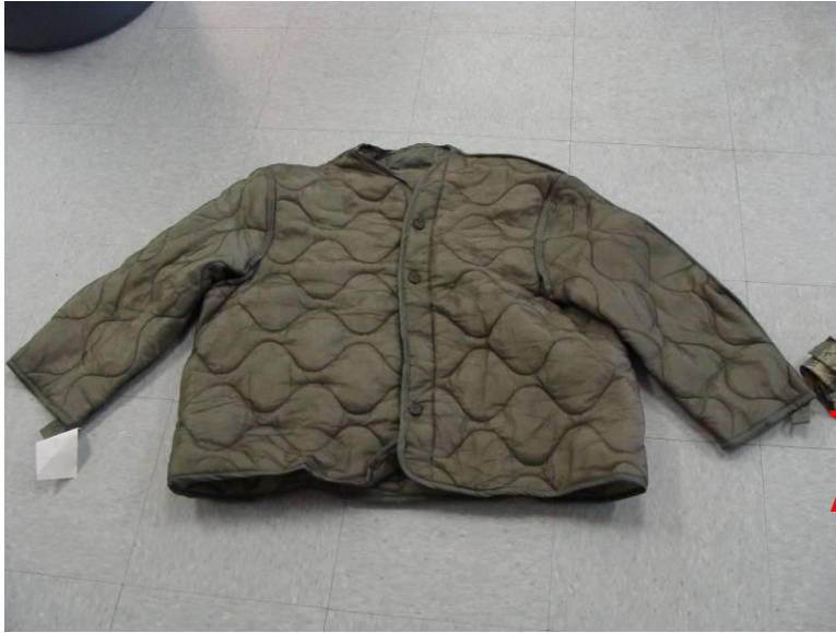
IMPROVED RAIN SUIT LINER Authorized under the IRS