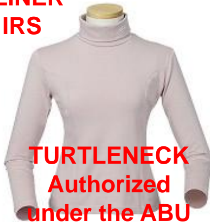
TURTLENECK Authorized under the ABU