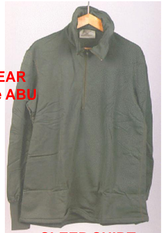
SLEEP SHIRT Authorized under the ABU