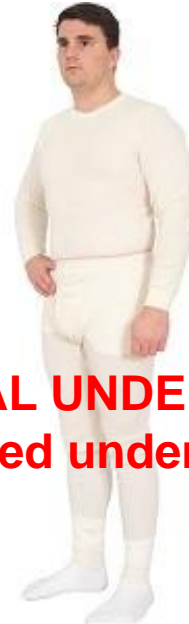
THERMAL UNDERWEAR Authorized under the ABU