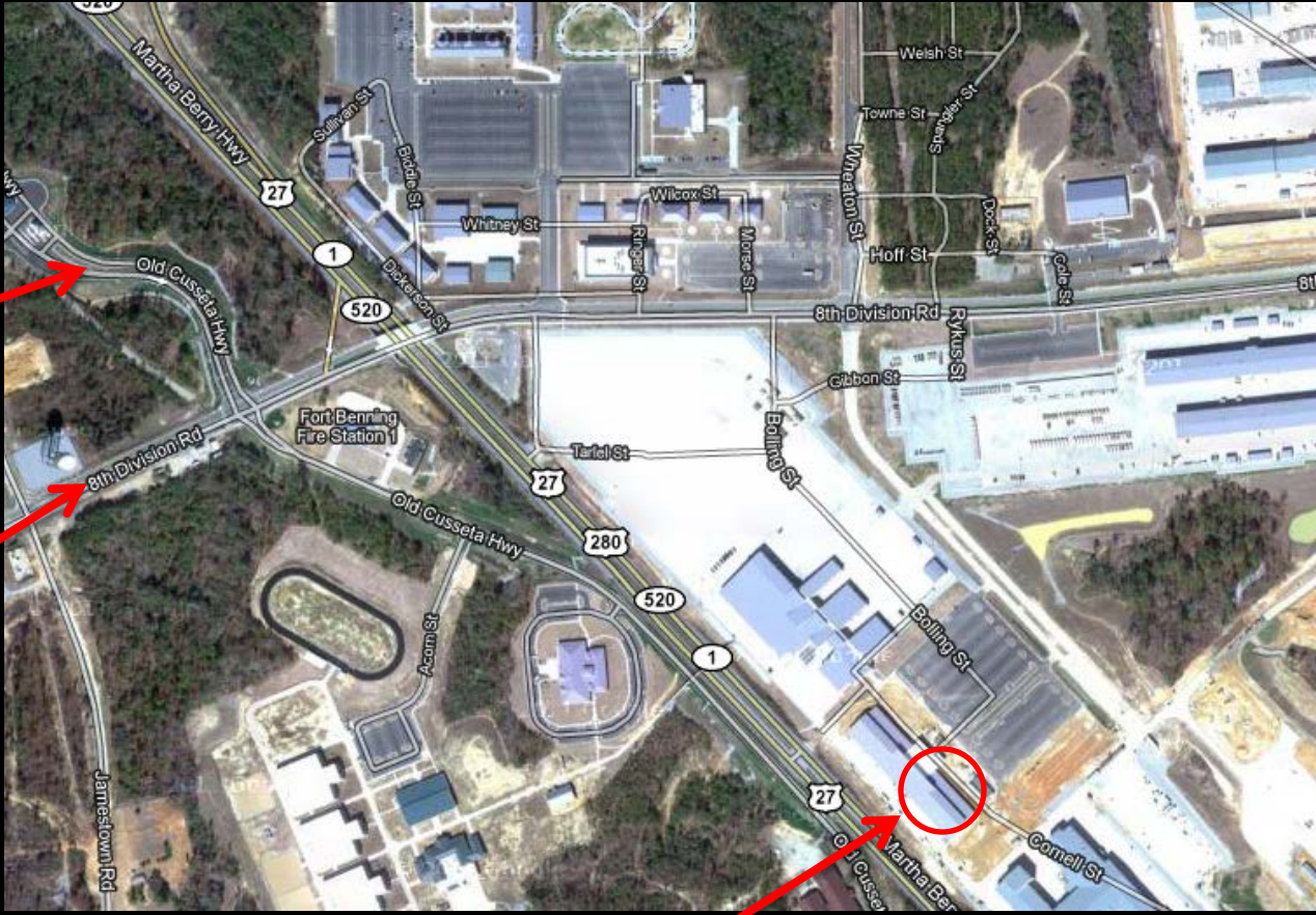
Master Gunner School: Bldg 5210, Harmony Church (Click the Circle for Google Maps Link)