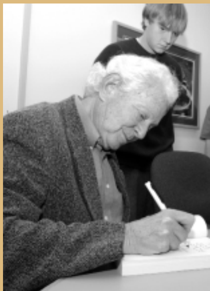
Leon Lederman signed copies of his book, The God Particle , for students from Altamont School during their visit to Fermilab.

"A theory is only good if it fits on a T-shirt," Lederman said. "The Greeks thought that when we find what we're ultimately looking for, we'd be rolling on the floor with laughter because it would be so simple, we'd wonder why it took us so long to find out."