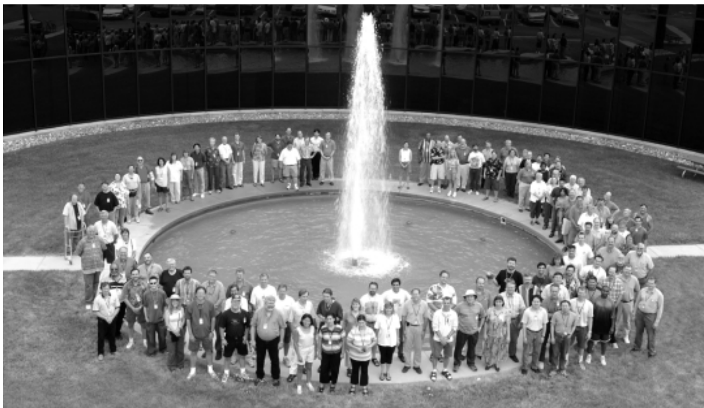
Members of the Computing Division gather outside the Feynman Computing Center.