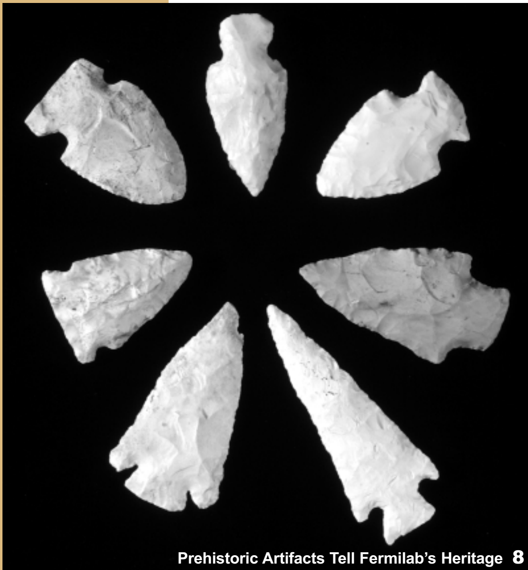
Prehistoric Artifacts Tell Fermilab's Heritage 8