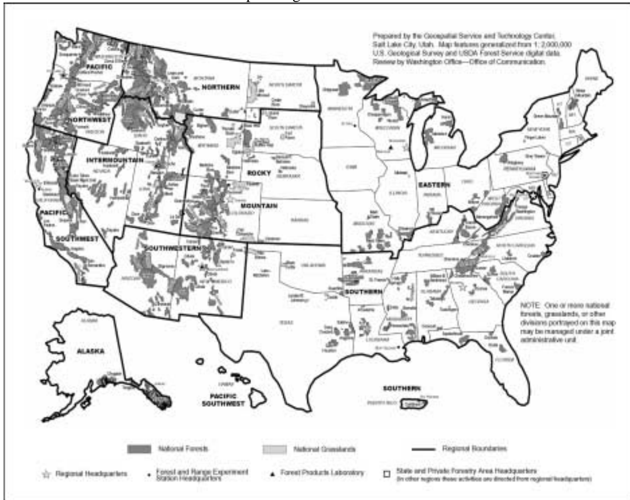
Map of Organizational Units