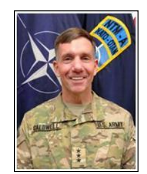
WILLIAM B. CALDWELL, IV Lieutenant General Commander

NATO Training Mission-Afghanistan / Combined Security Transition Command-Afghanistan (NTM-A / CSTC-A) in coordination with NATO nations and partners, international organizations, donors and non-governmental organizations; supports the Government of the Islamic Republic of Afghanistan (GIRoA) as it generates and sustains the Afghan National Security Force (ANSF), develops leaders, and establishes enduring institutional capacity to enable accountable Afghan-led security.