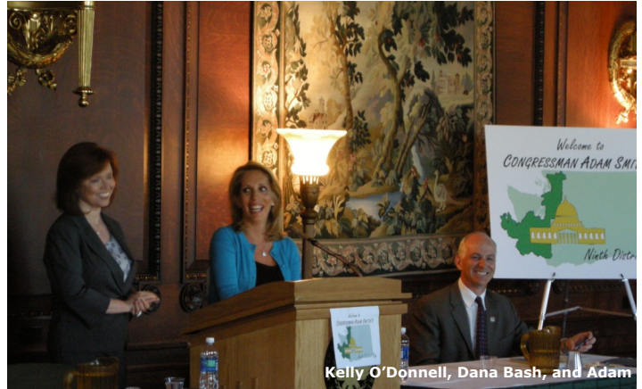
Kelly O'Donnell, Dana Bash, and Adam

More photos, and information on how to register for next year's event, can be found on Adam's website: http://AdamSmith.house.gov