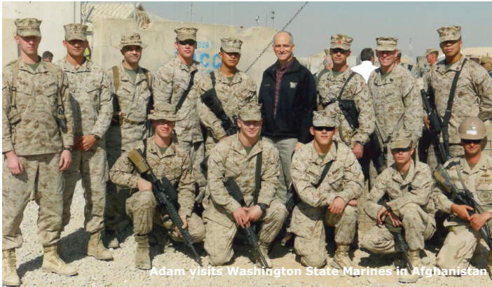
Adam visits Washington State Marines in Afghanistan

On May 12th, the House Armed Services Committee passed the FY 2012 National Defense Authorization Act by a vote of 60-1. Ranking member Adam Smith made the following remarks: