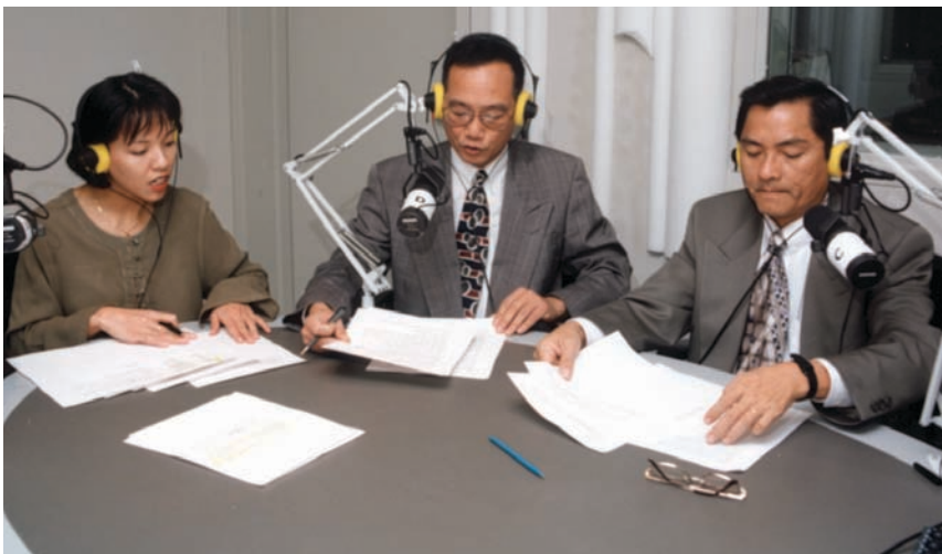
RFA's Vietnamese Service broadcasts daily from Washington, D.C.

In addition to its news programming, RFA strives to be a "university of the air," broadcasting works of literature and nonfiction that have been banned in RFA target countries. RFA also aims to give its Asian listeners a vehicle to voice their own thoughts through five call-in programs—three in Mandarin, one in Tibetan, and one in Khmer—whereby listeners may dial a toll-free number and speak directly with an RFA host.