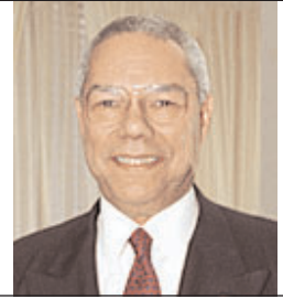
Colin L. Powell