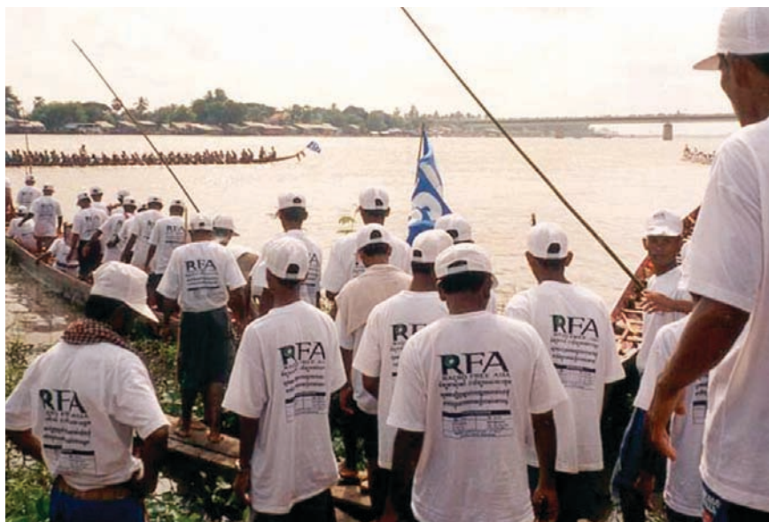
RFA established a presence at the Cambodian boat races in 2001.

RFA added two new facilities to its list of broadcast sites. Today RFA broadcasts from 11 transmitter sites from Saipan and Tinian in the Pacific to Holzkirchen in Germany. To overcome extensive jamming from China and Vietnam, RFA broadcasts simultaneously on a large number of transmitters spread out around these countries in a diversified network.