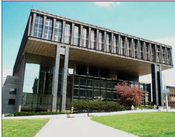
RFE/RL's Broadcast Center, in the former Czechoslovak Federal parliament building on Wenceslas Square in Prague, Czech Republic.