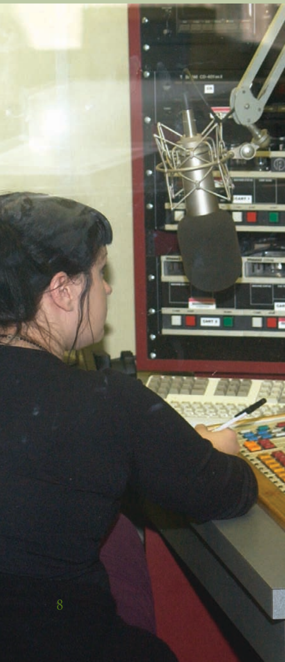
VOA broadcaster checks the time before going on air.