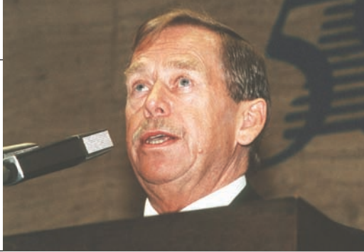
Czech President Vaclav Havel speaking in Prague at the Grand Assembly in honor of RFE/RL's 50th anniversary on May 14, 2001.