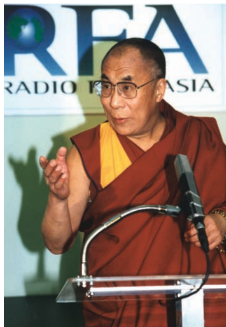
The Dalai Lama addresses an RFA audience.

RFA's Uyghur Service, which doubled its broadcasting in 2001 to two hours daily, reported on unsuccessful efforts to rescue an ethnic Uyghur woman caught in the September 11 attacks in New York.