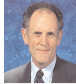
Edward E. Kaufman

The BBG's component broadcasters—the Voice of America (VOA), WORLDNET Television, Radio Free Europe/Radio Liberty (RFE/RL), Radio and TV Martí and Radio Free Asia (RFA)—reach a total of about 100 million people a week through radio, television and the Internet. The International Broadcasting Bureau (IBB) provides technical, engineering, marketing, research and administrative support to broadcasters. The IBB has a budget of $191.1 million.