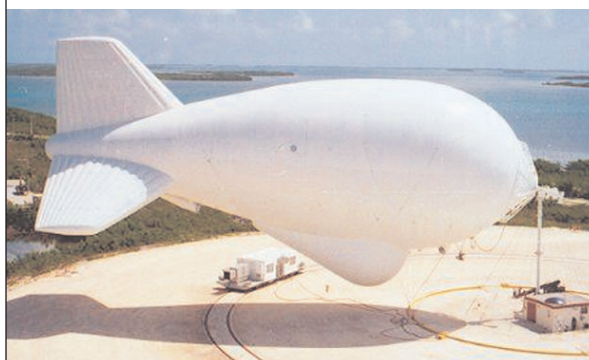
TV Martí's Aerostat System moored at Cudjoe Key Air Force Station in the Florida Keys.