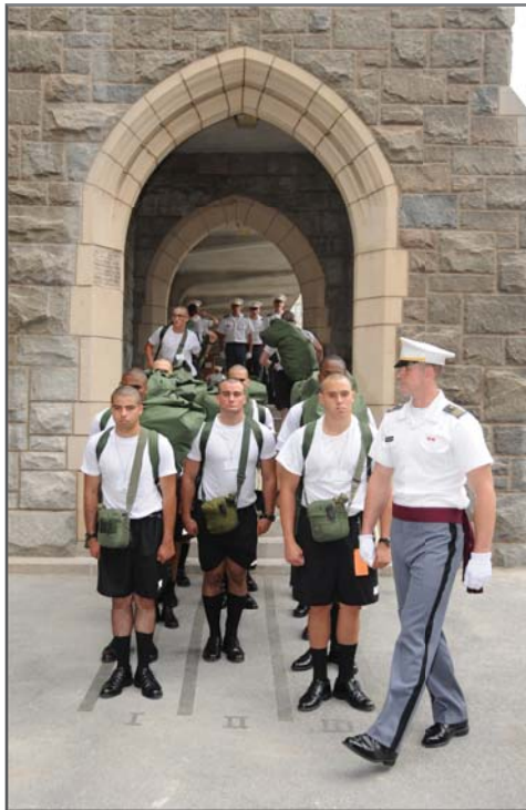
New cadets wait between R-Day stations.