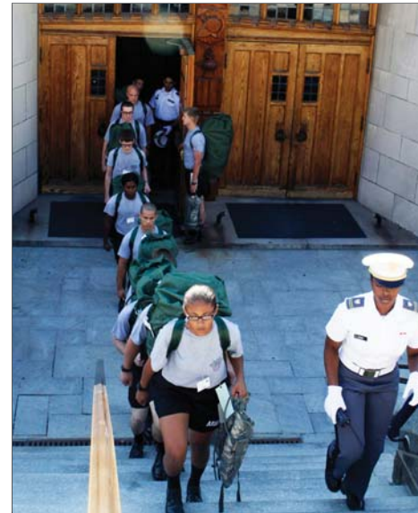
New cadets leave Thayer Hall on R-Day '11.