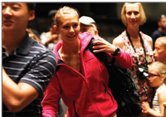
A new cadet starts her journey on R-Day 2011.

If you complete college-level courses before entering West Point, you may be able to validate your course work to obtain advanced placement, but you must complete four full years at West Point in order to graduate. Participating in school, church, scouting and community activities will help you build a strong foundation in leadership. Active participation in sports is, by far, the best preparation for West Point's rigorous physical-development program.