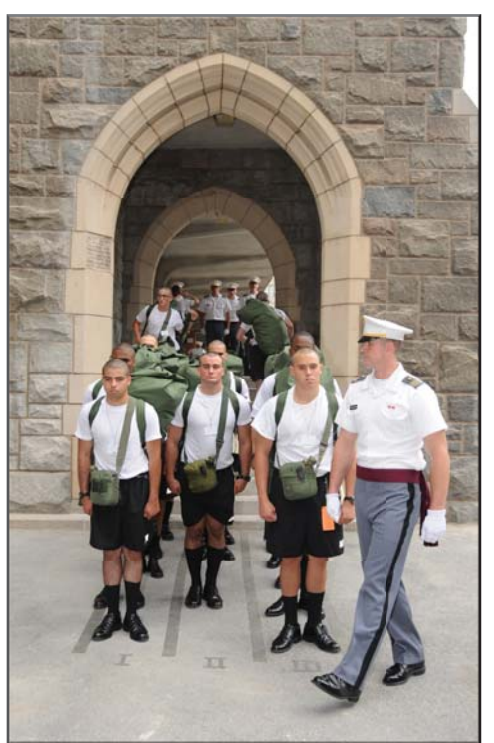
New cadets wait between R-Day stations.

The international cadets are from the countries of Cambodia, Costa Rica, Georgia, Jordan, Korea, Lithuania, Qatar, Rwanda, Thailand, Tunisia, and Zaire. Upon graduation, those cadets will return to their countries as officers in their respective armed forces.