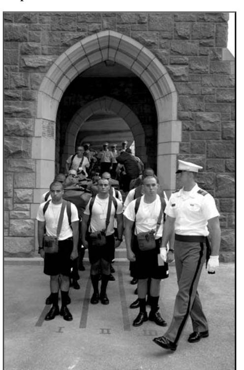
New cadets wait between R-Day stations.

The international cadets are from the countries of Albania, Colombia, Georgia, Honduras, Kyrgyzstan, Latvia, Lebanon, Nicaragua, Panama, Peru, Philippines, Poland, Romania, Rwanda, Slovenia, Taiwan, Thailand, and Tunisia. Upon graduation, those cadets will return to their countries as officers in their respective armed forces.