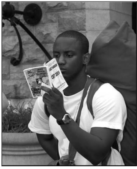
A new cadet studies the handbook on R-Day '09.