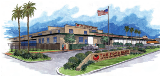
This rendering illustrates the proposed Rio Grande Valley Food Bank in Pharr, Texas.

city set up a $50,000 matching fund for a façade improvement program to encourage the private sector investment for the restoration and preservation of the city's historic district. As a result, seven local banks matched the city's commitment and set up a $637,000 low interest loan pool to encourage further private investment in façade restoration. The ripple effects of these CDBG activities include other projects led by citizen volunteers, such as an inventory of the local historic cemetery resulting in the