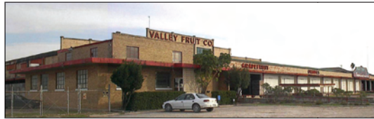
This building is the sight that will become the Rio Grande Valley Food Bank in Pharr, Texas.

On-going projects also include conducting the city's first preservation master plan. This policy document and vision statement from the community was the first of its kind among the 46 cities and towns in the Lower Rio Grande Valley. In addition, CDBG funding is being used to conduct a restoration plan for the city's first fire station. The latter has included asbestos testing and removal, performing a structural study and a floor plan sketch. The restoration plan will also include an architectural rendering and plan of action to restore the structure's exterior, interior and original landscaping features. In addition to these efforts, the