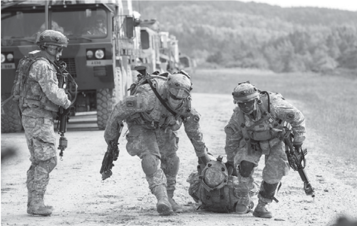
Members of the 173rd Airborne Brigade Combat Team train for their Full Spectrum Training Event held at Hohenfels, Germany.