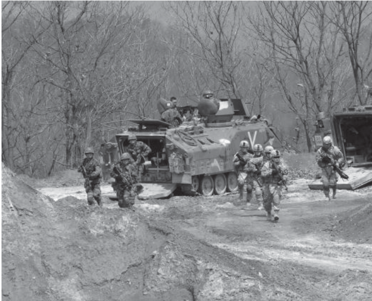
Republic of Korea Army soldiers with U.S. soldiers from the 75th Mechanized Infantry Brigade and 2-9th Infantry, 1st HBCT, dismount their armored personnel carriers during a combined arms live fire exercise, 15 April 2010.

operations—and equal in importance to major combat operations.