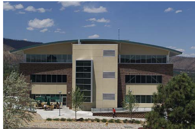
Los Alamos Research Park

The Laboratory actively assisted Los Alamos Commerce and Development Corporation in the planning and launch of the Los Alamos Research Park project in 2001. The facility houses important strategic partners to the Laboratory, such as Motorola and the University of California. It is also home to LANL's Superconductivity Technology Center co-located with several industry partners and a Synergy Center, in which several LANL small spin-off companies such as Isotag and Radion Technologies reside. The Laboratory was recognized as the "2001 Laboratory of the Year" by the Federal Laboratory Consortium midwestern region for its Research Park project support.