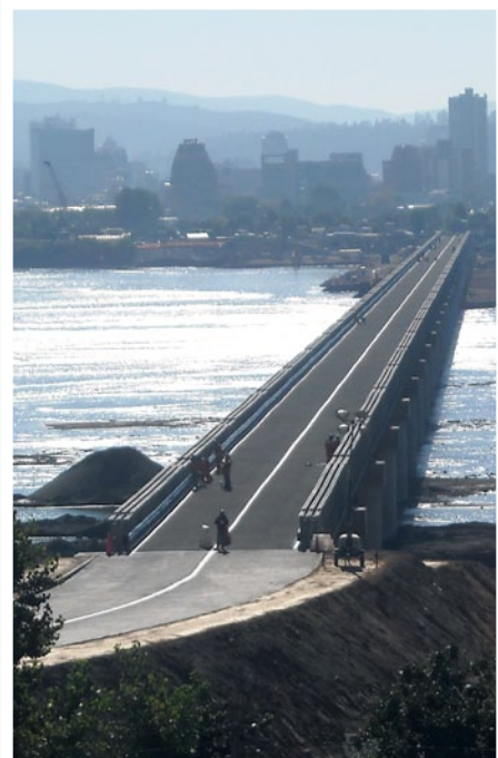
Acrow Corporation modular bridge in Chile.

The modular bridge project in Mexico was successfully completed according to the Mexican Secretariat’s specifications. CS helped the company recoup the $800,000 bond since the project was completed on schedule. Overall, Acrow now sells to more than 60 countries, and in 2010–11, shipped 20 bridges to Mexico, 100 to Ghana, 36 to El Salvador, 24 to Peru, and a 1.4 kilometer emergency bridge to Chile. Exporting has enabled Acrow to succeed through a tough economy and grow by over 400 percent since 2007. In 2011, LabCon was awarded the President’s “E” Award for Excellence in Exporting.