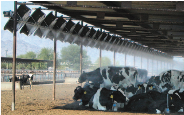
Schaefer Ventilation's patent pending FlipFan® Dairy Cooling System rotates 180 degrees to follow livestock, reducing heat stress and heat-related losses.

When Schaefer Ventilation first contacted the U.S. Commercial Service (CS) office in Minneapolis, the company had identified demand for its products in North Africa, the Middle East, and South Asia. However, before moving forward, it first had to gain a greater understanding on how best to navigate the many steps in the export process—areas such as market strategies, logistics, documentation, financing, and more. This knowledge would be a precursor to putting together a comprehensive export strategy that would hold the key to success.