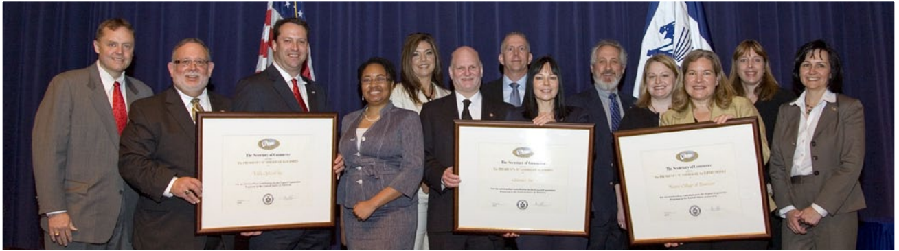
Ohio "E" Award winners Volk Optical, Codonics, and Cleveland State University's Nance College of Business receiving their awards on May 16, 2011 in Washington, D.C.

The President's "E" Award was created by President John F. Kennedy in 1961 to recognize persons, firms, or organizations that contribute significantly to increasing U.S. exports. On May 16, 2011, U.S. Secretary of Commerce Gary Locke presented 27 companies and organizations with the President's "E" Award and "E" Star Award for significant contributions to U.S. export expansion, which strengthens the economy and creates American jobs.