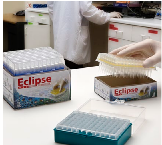
Labcon Eclipse™ pipet tip refills, made from compostable resin.