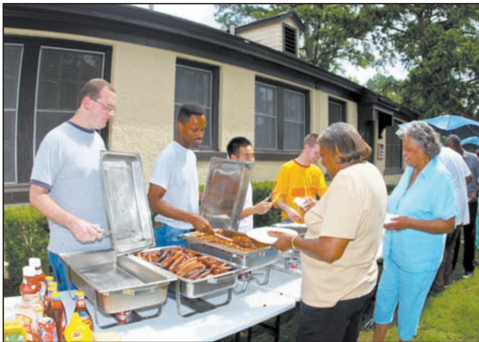
Staff members from the 42nd Air Base Wing base chapel serve lunch Sept. 1 to Hurricane Gustav evacuees staying on Maxwell Air Force Base, Ala. The chapel staff served food to about 150 of the more than 650 military and family members and government employees who evacuated to Maxwell from the Gulf Coast.

Officials at the reception center placed 34 evacuees in the homes of volunteers on and off base, and only a handful of people were placed in the