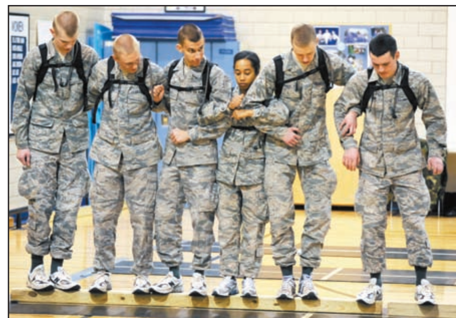
Right and below: Developing teamwork strategies is encouraged for many events where fourth-class cadets are required problem solve. Remaining good followers under the leadership of upperclassmen was key to their collective success.