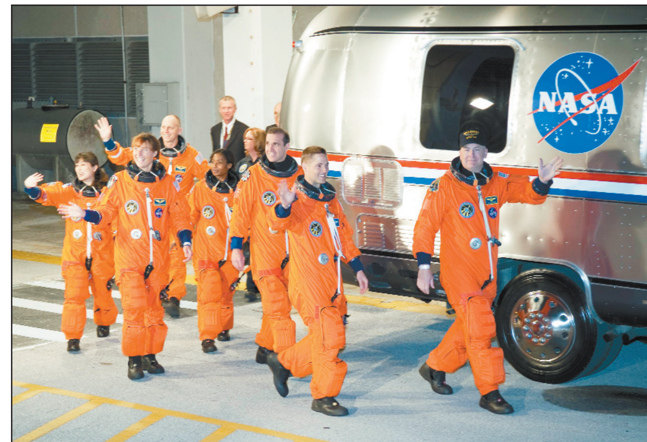
After suiting up, STS-131 crew members exit the Operations and Checkout Building to board the Astrovan, which took them to Launch Pad 39A for the shuttle launch.

Space Shuttle Discovery and its seven-member STS-131 crew head toward Earth orbit and rendezvous with the International Space Station at 6:21 a.m. Eastern Daylight Time Monday.