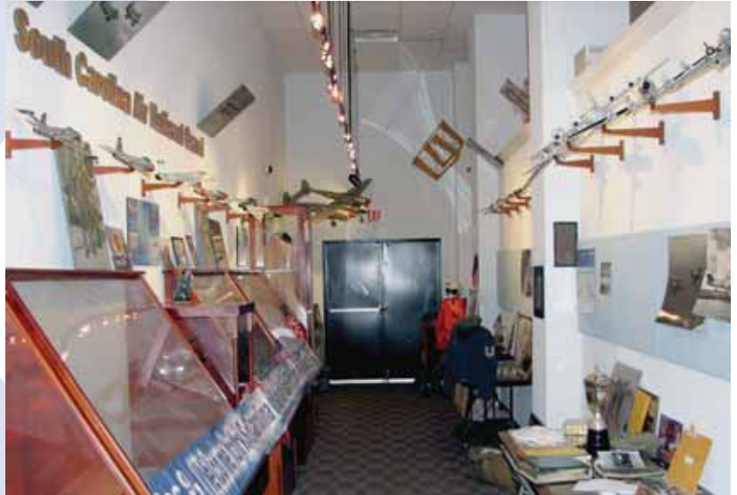
Work on the Air National Guard wing of the SC Military Museum is nearing completion.