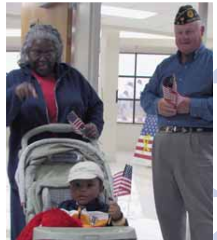
Members of the American Legion greet family members arriving at the 122nd welcome home ceremony.