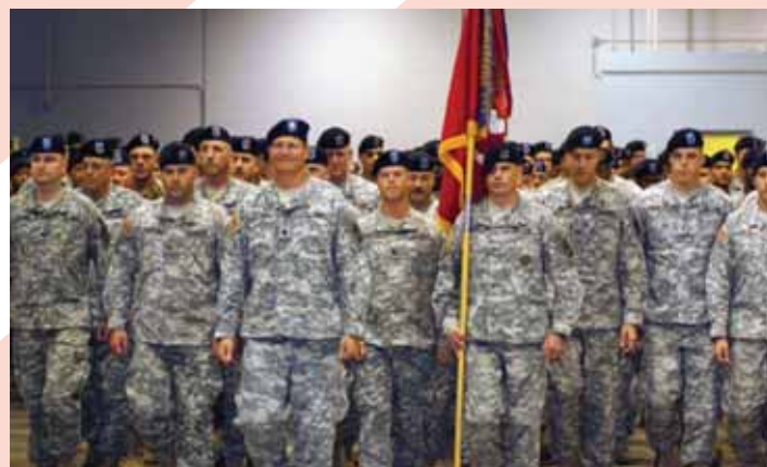
Soldiers of the 2nd Battalion, 263rd ADA triumphantly march into the Armory upon their return November 30.