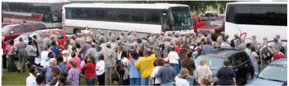
Families of 1st of the 263rd soldiers crowd the buses as their soldiers depart.

The 1st of the 263rd will be performing security forces training at Camp Shelby for the advance team mission of the 218th Heavy Separate Brigade's embarkation to Afghanistan in 2007. It will mark the single largest deployment of SC Army National Guard troops since World War II.