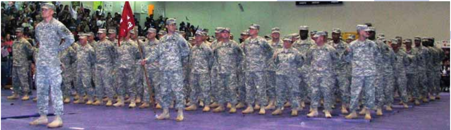
The 122nd Engineers form up for their welcome home ceremony.