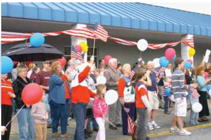
Family and friends of the 2nd Battalion, 263rd ADA cheer when they see the buses pull into the Armory parking lot.

Following a brief welcome home ceremony and reception, the soldiers were released to spend much-deserved time with their families and friends.