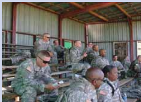
Some of the soldiers of the 151 FA Bde wait their turn to go through scheduled training during their mobilization at Fort Sill, OK.