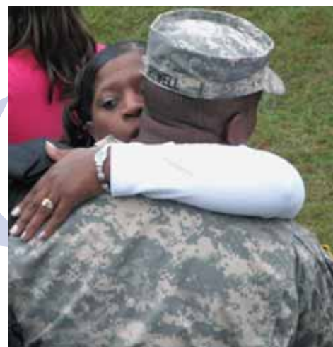
A 1-263rd soldier receives one final hug before boarding the bus.