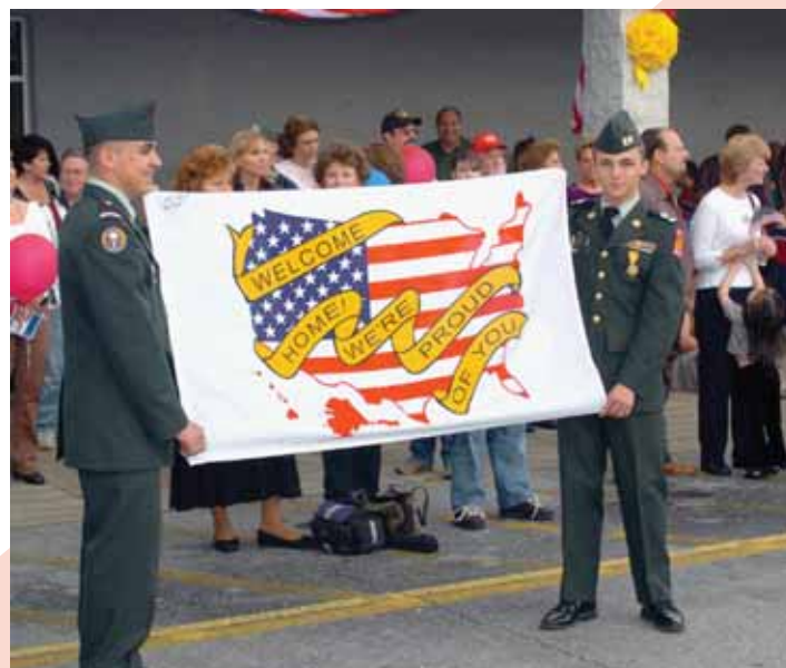
Members of the Seneca High School JROTC hold a sign welcoming home the returning soldiers.