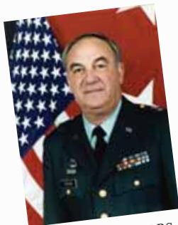
STANHOPE S. SPEARS MAJOR GENERAL THE ADJUTANT GENERAL