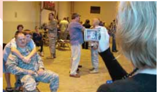
Bulbs flash throughout the morning as family members take photographs of their soldiers.