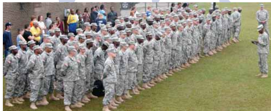
1st of the 263rd Armor Battalion soldiers prepare to board the bus for Camp Shelby, MS.