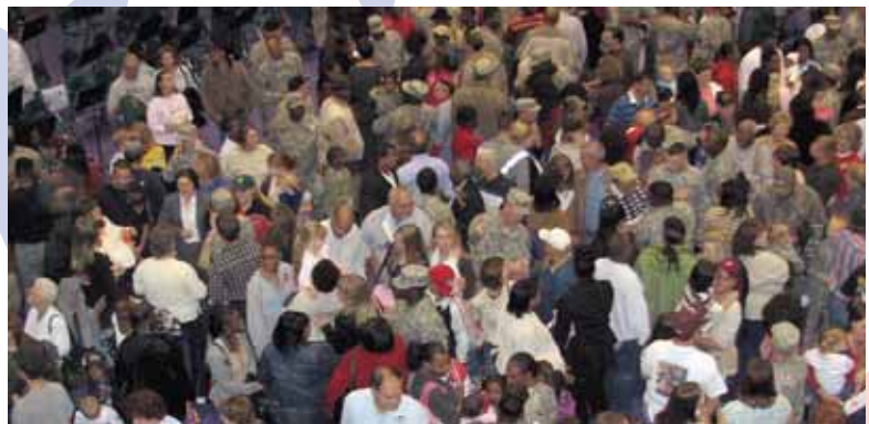
The tremendous crowd at the 122nd welcome home ceremony rush onto the floor to see their soldiers.