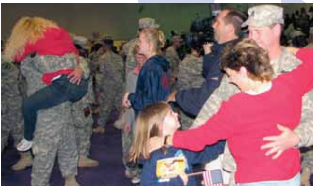
Reunited families happily embrace one another.