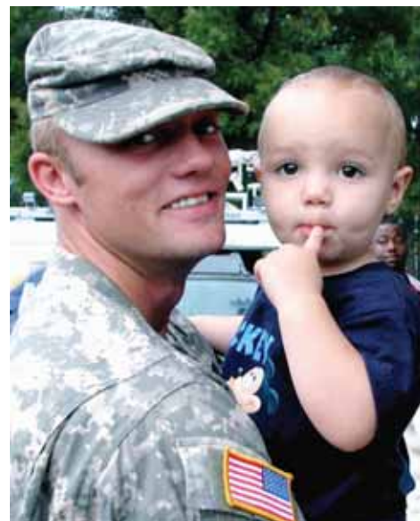
A young 1-263rd soldier tells his little boy, "I'll see you later."