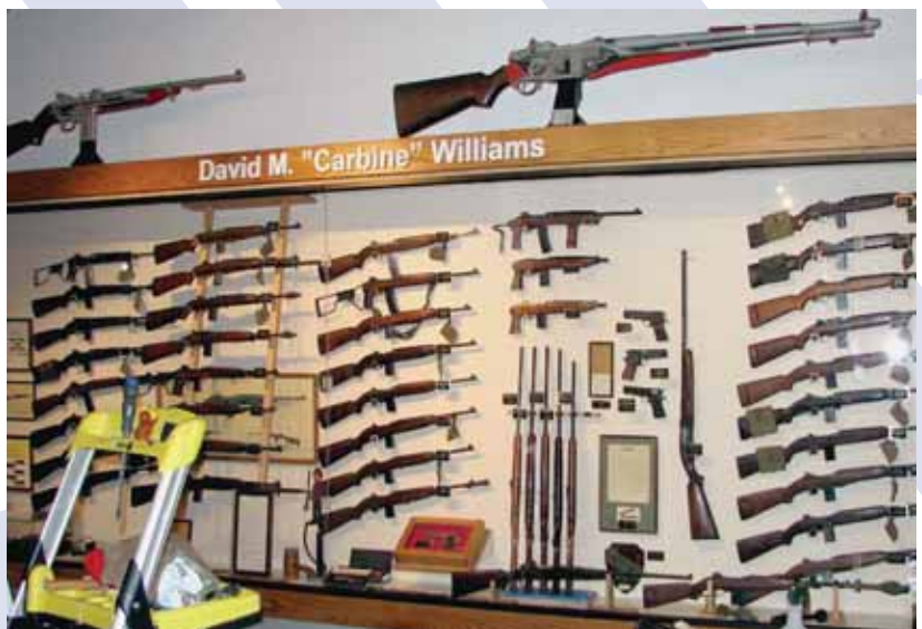
The "Carbine" Williams display of the SC Military Museum nears completion.