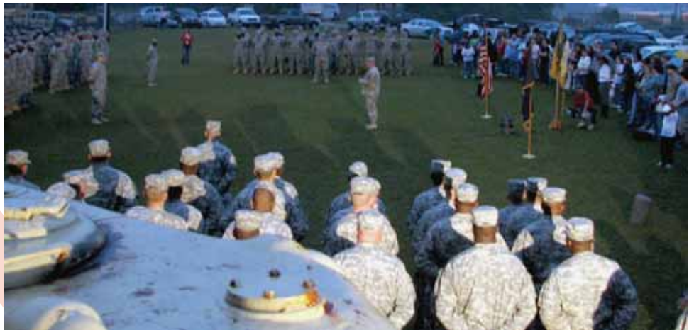
Members of the 1/263rd Armor Battalion form up at sunrise.