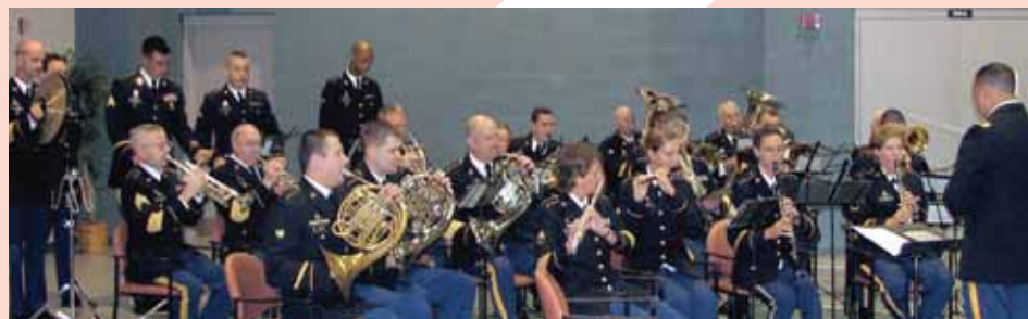
South Carolina's 246th Army National Guard Band performs for the PMA graduation audience.