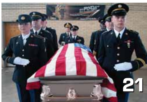
21 The expanding S.C. Honor Guard Team has supported over 200 military funerals recently utilizing the "Old Guard" standards.