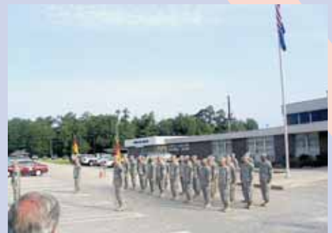
Final formation for soldiers of the 151 FA Bde prior to leaving for their mobilization station at Fort Sill, OK.