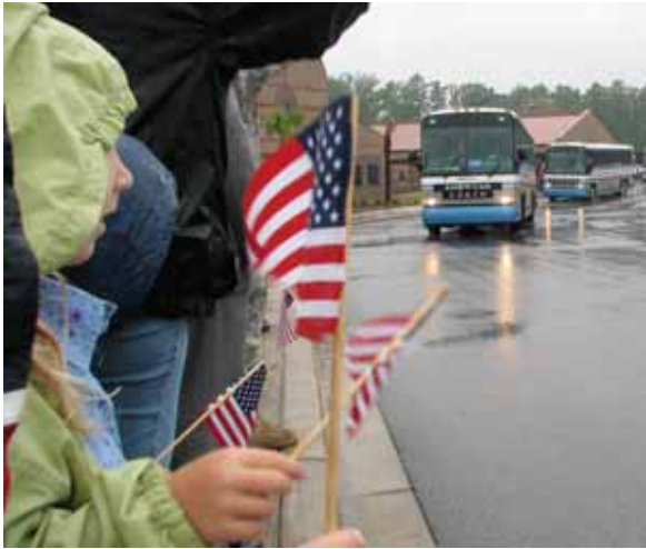
The buses arrive, bringing soldiers home to their families.