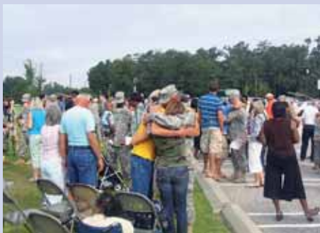
Family members and friends get a last hug and best wishes for a safe deployment and return home.

mission. However, by the time the mobilization date rolled around, the unit was to send only approximately 40 soldiers. To date, those 40 soldiers are still deployed in Iraq, performing their duties to the best of their abilities in a professional and proud manner.