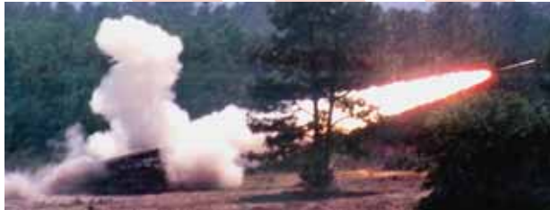
On May 1, a MLRS launcher crew from Btry A, 3-178th FA fires the first rocket in more than two years from Firing Point 19 at McCrady Training Center during annual training.

F or the 3rd Battalion 178th Field Artillery, the year meant getting back to what it does best: Performing as an MLRS Battalion. After successfully completing a deployment to Iraq with a non-standard mission, the battalion and its soldiers were ready and eager to begin training on their crew-level, field artillery-specific tasks. This came with tremendous leadership challenges due to the fact that the battalion had not trained on any FA-specific tasks in more than two years, and a lot of turnover had occurred in the makeup of the launcher crews and in key leadership positions. The history of the battalion held true during these times, as its soldiers and leadership once