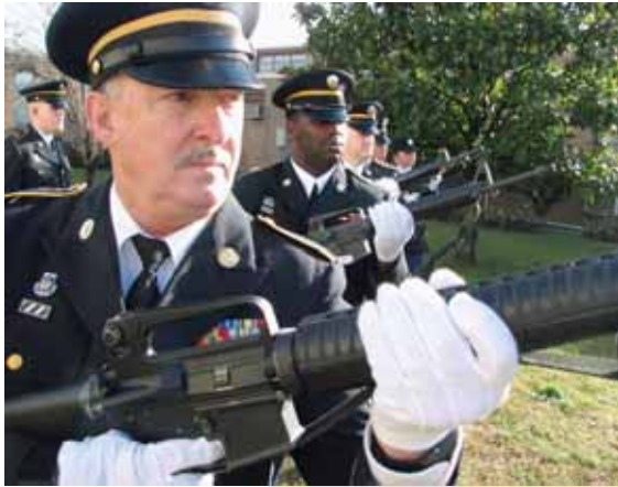
The firing party prepares for a three-round volley.