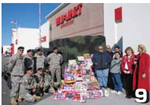
9 678th Engineers team up with Debi's Kids and Wal-Mart to help needy kids at Christmas.