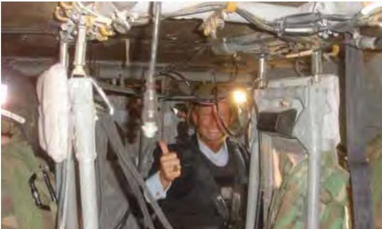
Former SCNG Colonel Joe Wilson while on one of his many congressional visits to Iraq.