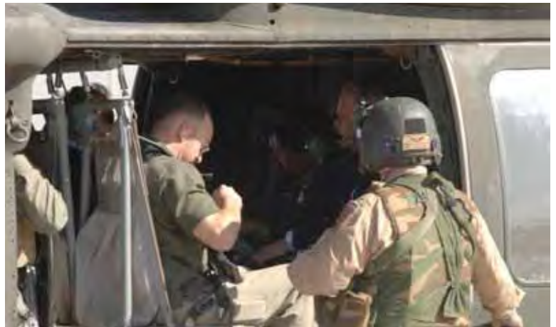
The Catfish Company flew many dignitaries in Iraq, including Secretary of State Condoleezza Rice, in large security formations.