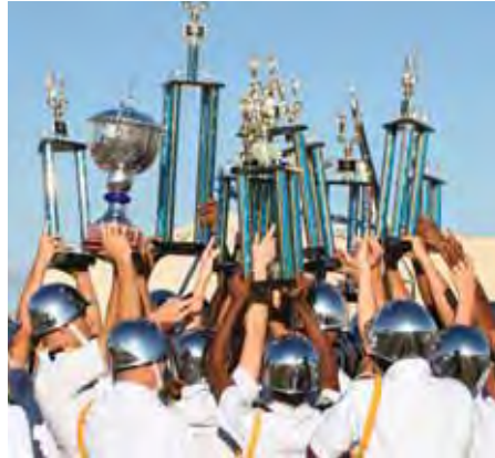
Members of the Spring Valley High School JROTC from Columbia celebrate their win of the first annual Southeastern Drill Championship.