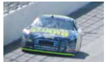
Prior to the Busch race at Darlington Raceway on Friday, May 12, Biffle qualified to start from the ninth position for May 13's Dodge Charger 500.