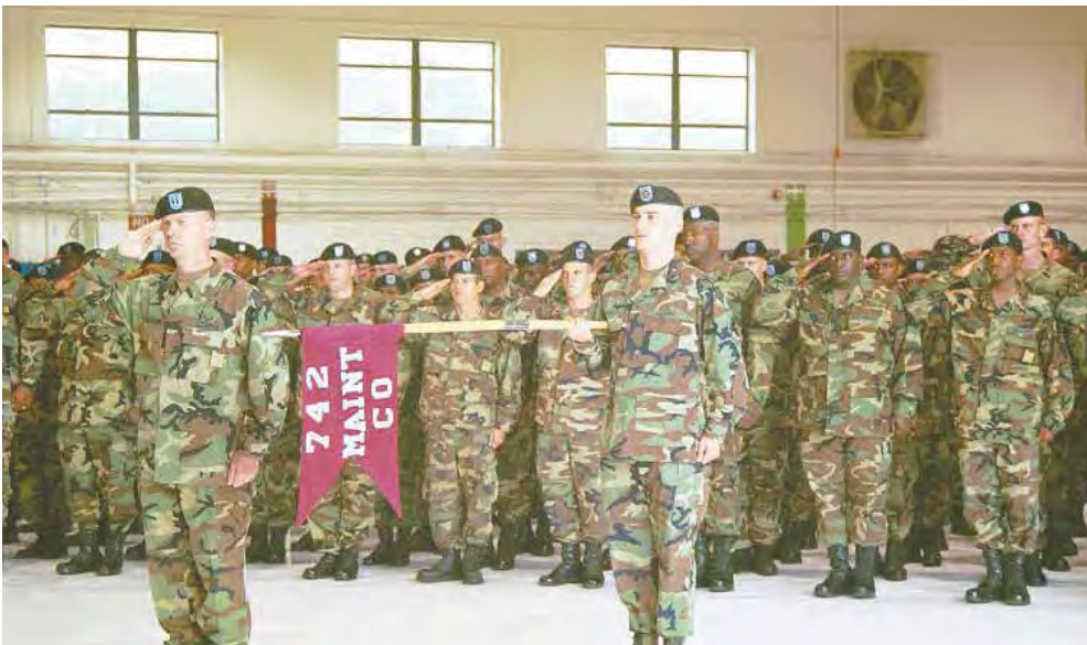
The 742nd Maintenance Battalion comes home from "Operation Quick Fix."