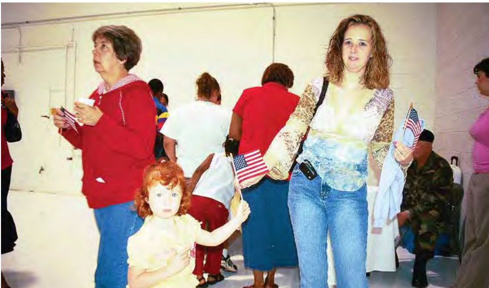
The family of a 742nd Maintenance Battalion soldier.