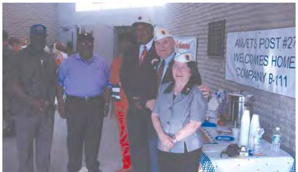
Veterans of previous wars show up to welcome our troops home.