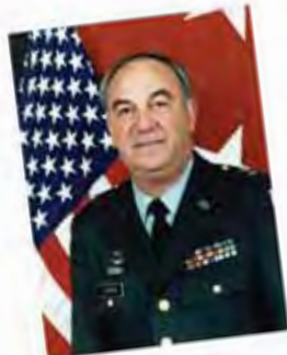
STANHOPE S. SPEARS MAJOR GENERAL THE ADJUTANT GENERAL