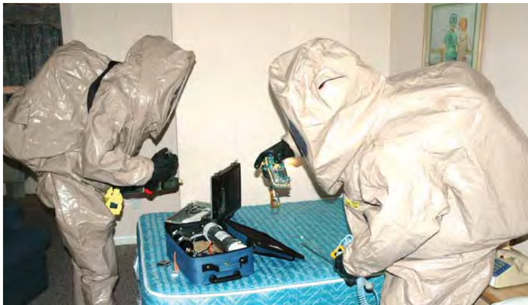
Two members of the 43rd Civil Support Team, based in West Columbia, check for contamination in a Sea Mist hotel room in Myrtle Beach during a training exercise, which took place February 14-16. The 22-person team blends soldiers from both the Army and Air National Guard and is the only SC Guard unit that is full-time active Guard and Reserve. The 43rd CST conducted the training with their counterparts from Pennsylvania.