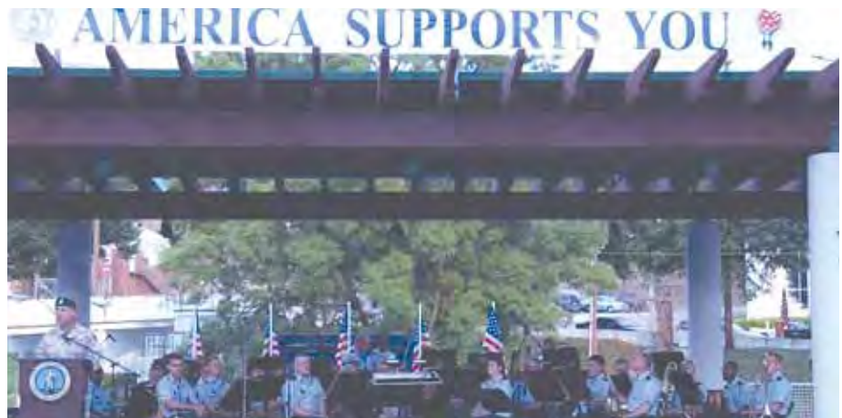
The band played on during the Department of Defense's "American Supports You" rally, held last year in Finlay Park.