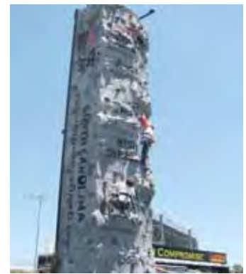
The SC National Guard's climbing wall remains one of the more popular pre-race events for NASCAR fans who attended the 2006 Dodge Charger 500.

Later that evening, Biffle, who began the 2006 Dodge Charger 500 from the ninth spot, moved up to first, led the race for 170 of its 367 laps and took the checkered flag for his first victory of the 2006 NEXTEL Cup season.