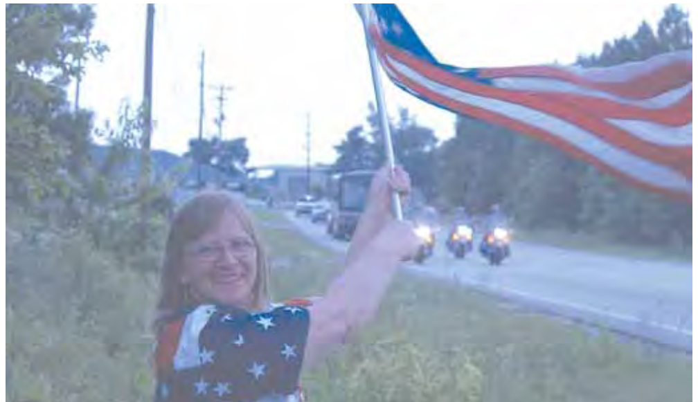
Blue Star Mothers from around the state welcome our SC National Guard troops.