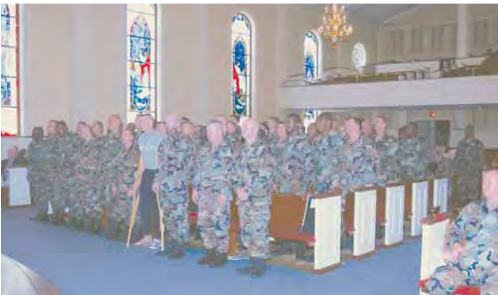
Following a yearlong deployment to Iraq, the US Army recognized C-Battery, 3-178 FA BN as the best field artillery battalion during its Freedom Salute in Hartsville, SC.