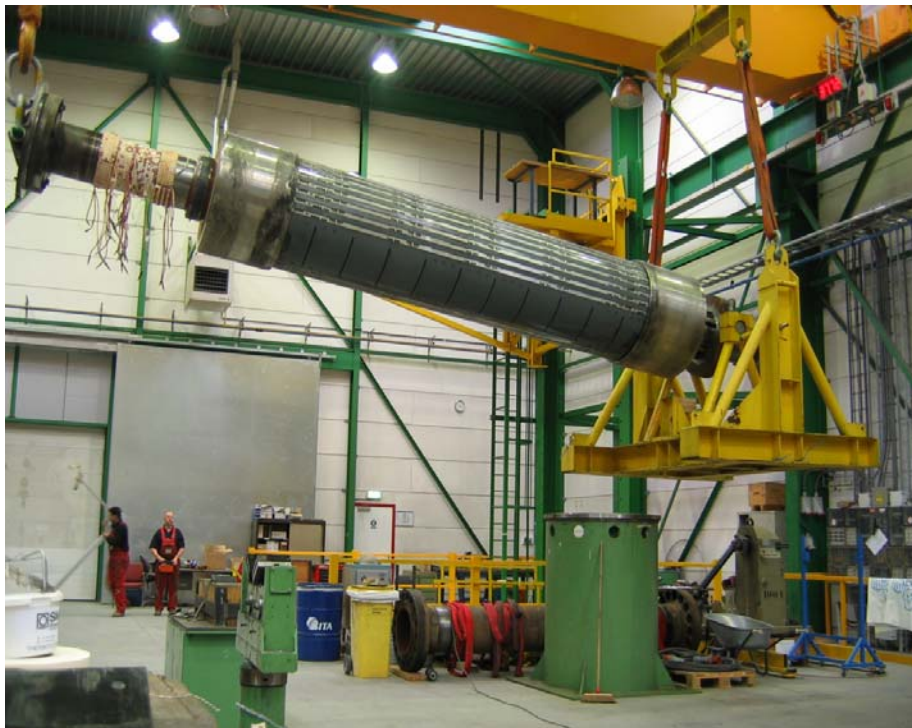
Figure 2—Turbine Generator Being Lifted during Repair

The contract called for the inspection and start-up of the units to be completed within 50 days after Wamar received permission to start work, but no later than sometime in fall 2006; the performance period was to be staggered by unit and by the work to be done. The work was to include the servicing of all auxiliary systems and the procuring, refurbishing, and/or repairing and transporting of all parts as required under the contract. Figures 2 and 3 show turbine generators during repairs.