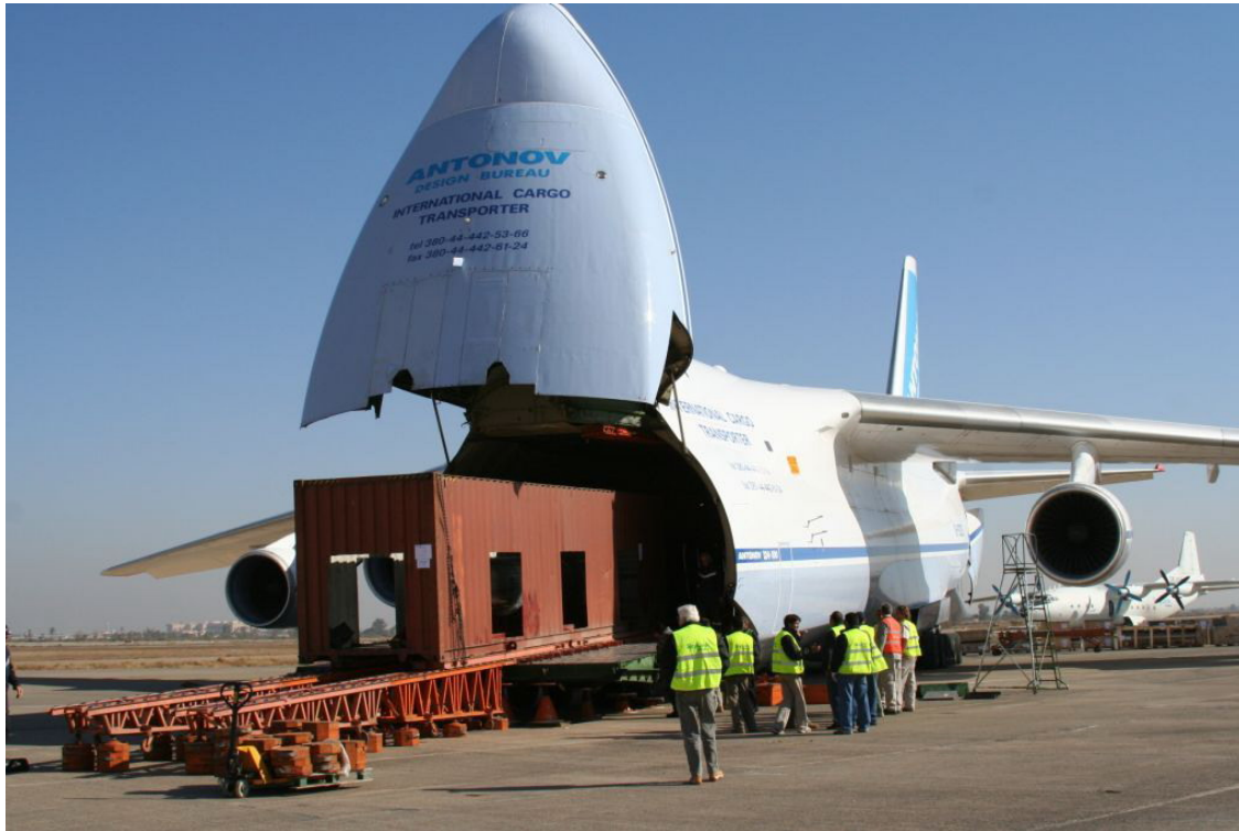
Figure 4—Transport of Turbine Generator Rotor for Repair