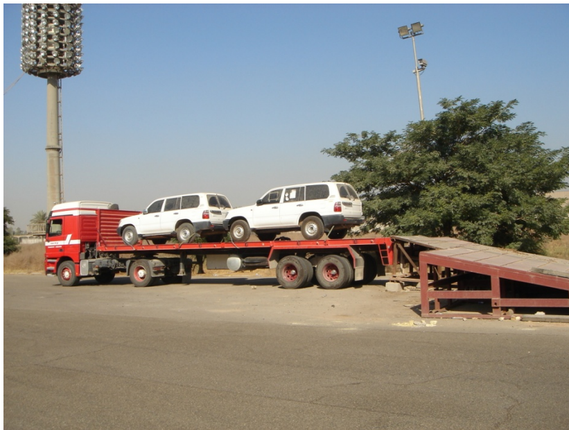
Figure 1—Armored Vehicles Being Delivered Overland in Iraq

vehicles. Wamar later delivered replacement vehicles. As such, the theft of the vehicles did not result in additional costs to the government.