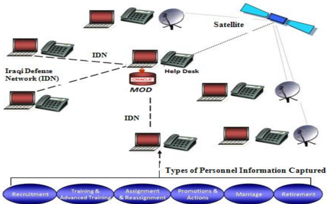
Figure 1—HRIMS Network