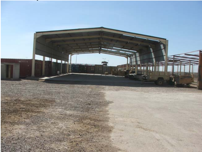
Photo 1: Open Air Pavilion Substituted for the Auditorium/Multipurpose Room

and construction of new facilities. The statement of work in the EPSS required the construction of a permanent structure suitable for large class training and formal presentations for 400 people. Our site visit conducted on March 12, 2006, however, verified that an existing open air pavilion was renovated and substituted for a new large auditorium/multipurpose room. The renovation of the pavilion appeared to be comprised of the installation of a concrete pad, installation of new overhead lighting, and partial replacement of the metal roof panels. The contractor's estimated budgeted cost for the construction of the auditorium/multipurpose room was $1.4 million. We estimated the cost of the renovation of the existing open air pavilion would likely be between $50,000 and $100,000 and therefore substantially less than $1.4 million. The open air pavilion is shown in Photo 1.