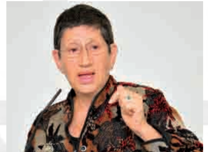
Elaine Heumann Gurian

Elaine Heumann Gurian, an independent museum consultant in the United States envisioned issues and possibilities in the area of learning for museums and libraries of the future. She also described emerging systems changes in primary and secondary education, such as group problem-solving, the teaching of civility, the focus on 21st century skills proficiency, and the providing of experience in the workplace, thus utilizing a full range of community assets. Gurian sees the distinction between school as place and education as function becoming increasingly disaggregated,