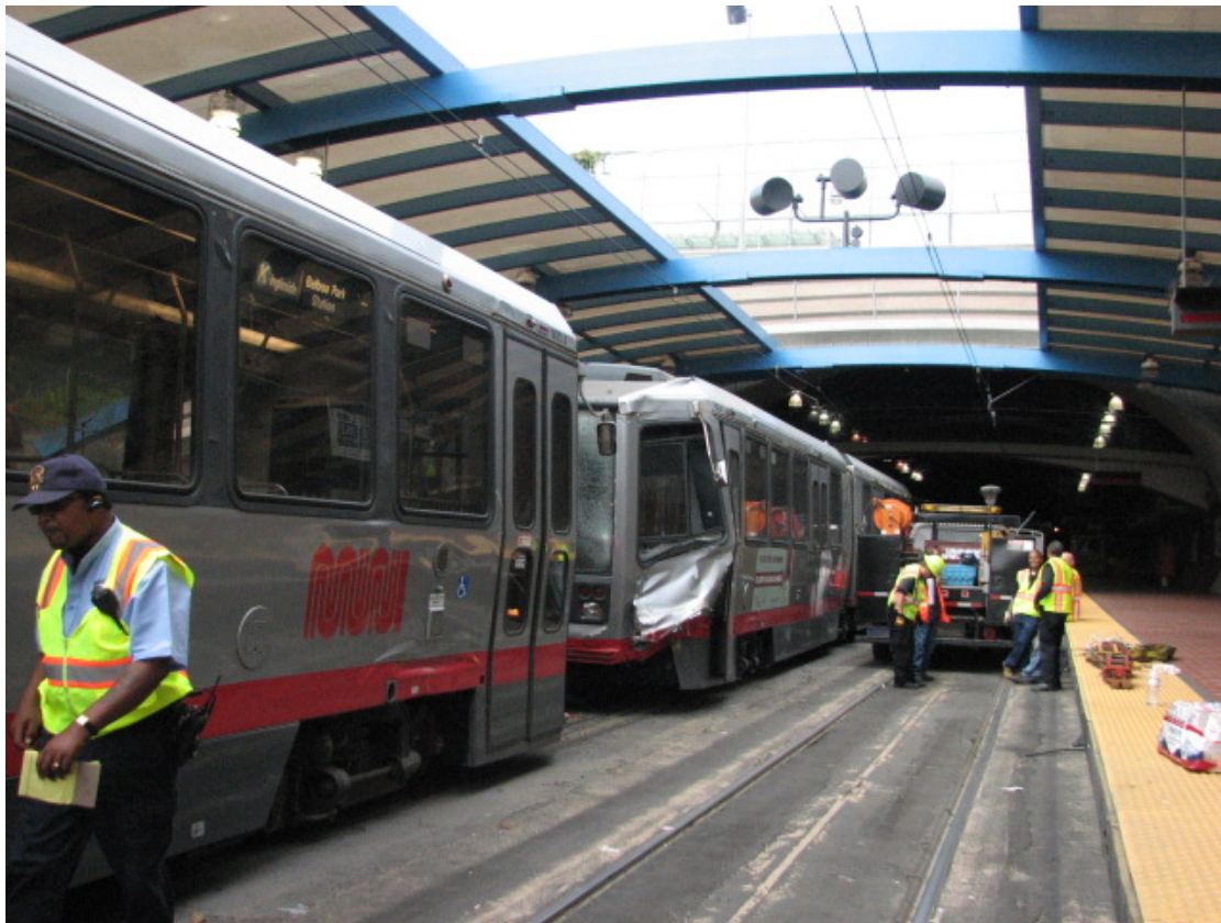
Figure 3. Photograph showing damage to front of striking train at site of collision.