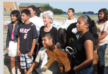
U.S. Secretary Kathleen Sebelius pictured with Sinte Gleska University students and one of their foals.