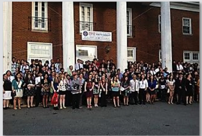
Group photo in front of the 4-H Youth Conference Center

The Summit week moved swiftly, beginning with a session led by elders who shared their personal experiences and words of wisdom with attendees. Group activities such as a Let's Move! session each morning and a traditional round dance provided exercise and broke the ice. Throughout the week, time was provided to allow youth >> Continued on Second Page