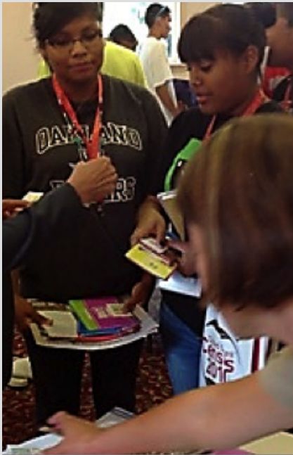
Talking with the Federal staff at the meet the Federal Partners session.

from tribes from the same region to visit and learn from each other.