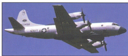
EP-3B of VQ-1

In the aftermath of the April 1969 tragedy, the Navy would adopt new procedures to provide its unarmed reconnaissance aircraft with a higher degree of protection from the fleet and Naval aviation. In addition, the EC-121 would be withdrawn from service with VQ-1 and VQ-2, being replaced by the faster EP-3, which remains in service today.