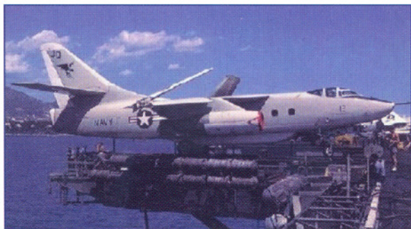
EA-3B BuNo 144850 "Ranger-12"

The Navy's national reconnaissance program did not disappear with victory in the Cold War and the collapse of the Soviet empire. The nation and the fleet still require the sensitive and timely intelligence that only aerial platforms can provide. VQ-1 and VQ-2 remain on duty, as does the Naval Security Group. Most recently, they have served with distinction in the Global War on Terrorism in Operations ENDURING FREEDOM and IRAQI FREEDOM. Current-day operations, however, like those bravely conducted during the Cold War, remain shrouded in secrecy by necessity.