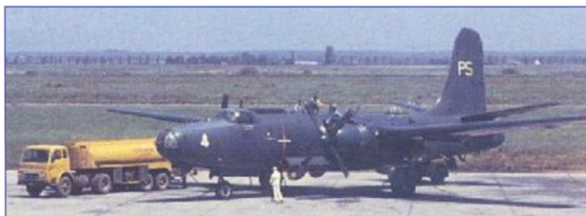
P4M-1Q of VQ-2 compared in size with an 18-wheel oil transport truck