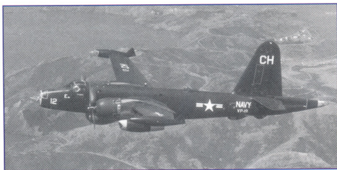
P2V Neptune of VP-19, circa 1950s

The Soviets attacked and shot down another VQ-1 SESP Neptune on 4 September 1954, when a P2V was downed over the Sea of Japan 40 miles off the Soviet coast. The fatally damaged craft was able to ditch and nine of the 10 crewmen were rescued by an Air Force SA-16 amphibian aircraft, but one officer, ENS Roger N. Reid, was lost while saving others.