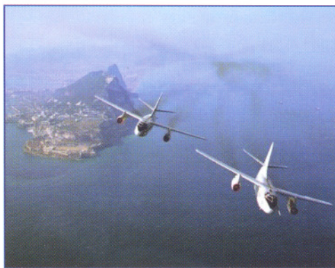
Two EA-3Bs of VQ-2 over Gibraltar

The missions themselves, with their long ranges and heavy payloads, were highly precarious, particularly EA-3B operations off carriers. Flying off aircraft carriers is a hazardous undertaking in ideal conditions – to say nothing of nighttime operations in rough seas, as was often the case. The “Whale,” thanks to its large size, was a difficult aircraft for even an experienced carrier pilot to handle, and mishaps were frequent.