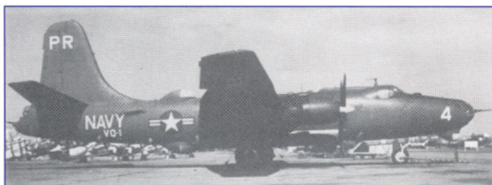
P4M-1Q of VQ-1

The VQ-1 aircraft (BuNo 124362) was lost at night and, despite an intense search and rescue operation, the body of only one of the 16 missing crewmen was recovered by the destroyer USS Dennis J. Buckley . The remainder were presumed dead (the PRC would later return the bodies of three crewmen). It was the costliest Naval reconnaissance loss to date. Unfortunately, the secrecy of the mission, combined with the Navy's lack of hard information about what happened to the aircraft, gave rise to rumors among families and the "secret sailors" of the SESP program that some of the missing aircrew were in Chinese captivity. Yet no credible evidence ever came to light to substantiate such rumors.