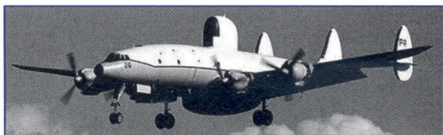
EC-121 of VQ-1

It was therefore especially tragic that the lost EC-121 (BuNo 135749) was flying its last mission with a double crew, 31 men in all, for training purposes. Nine of those aboard were NSG personnel.