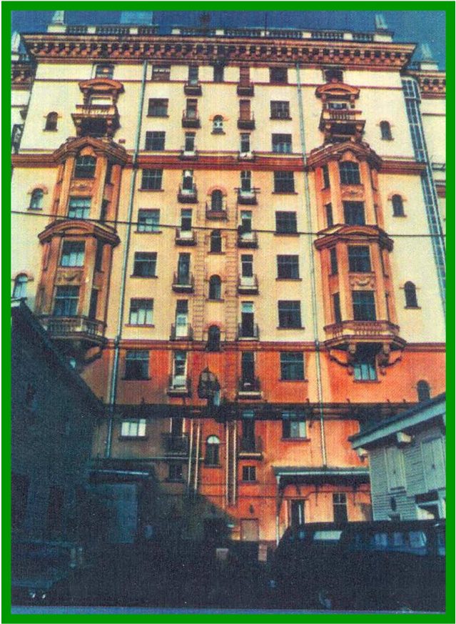
Fig. 1. U.S. embassy in Moscow. Equipment was lifted in and out of this building, possibly from the roof, since the Soviets had shut down the elevator.

The true nature of the GUNMAN project was successfully masked from most embassy employees. Ambassador Arthur Hartman learned about the project via a handwritten note that NSA personnel personally delivered when they arrived at the embassy. Ambassador Hartman announced that there was to be an upgrade of embassy