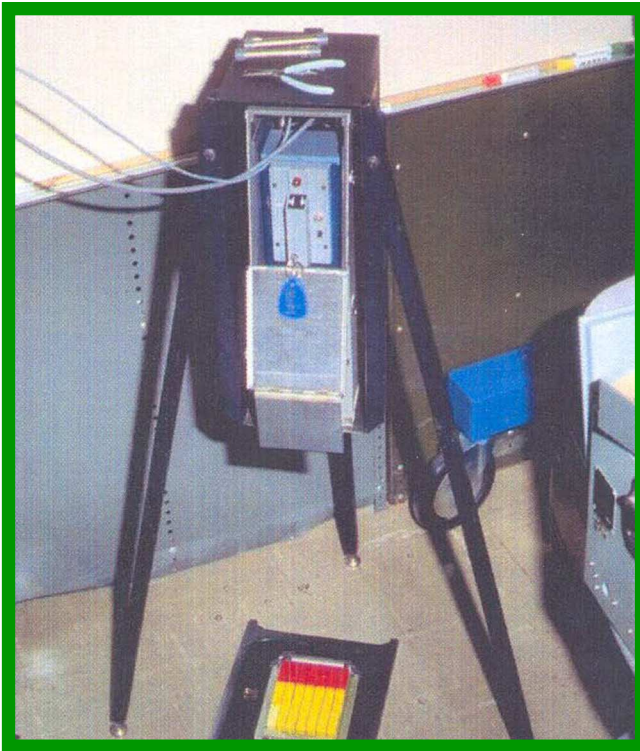
Fig. 2. Primary x-ray machine used in detecting equipment bugs. This was a portable machine about 8 inches deep, 6 inches wide, and 12-15 inches long. It was pointed at the floor when taking an x-ray; a sheet of x-ray film was placed under the item.

As the equipment from the embassy was returned to NSA, the COMSEC organization began a lengthy inspection process of each item. The equipment had to be inspected methodically to prevent the destruction of important evidence. The accountable COMSEC equipment was examined in the labs inside the OPS-3 or S building, the COMSEC facility on Fort Meade, while the nonaccountable COMSEC equipment was stored and examined in the trailers. Each item was inspected visually and then x-rayed. The x-rays were compared with known standards for each item. 18