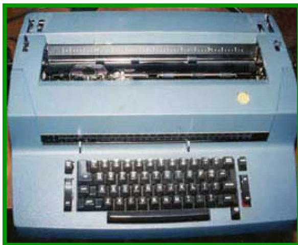
Fig. 3. IBM Selectric typewriter

A brief explanation of the general characteristics of IBM Selectric typewriters will aid in the understanding of how the implant worked. Most typewriters had metal arms that swung up against a ribbon to type a letter. IBM Selectrics, however, were unique because they used a round ball with numbers and letters around the outside surface. When a typist struck a key, the ball moved into position over an inked plastic ribbon and descended to imprint the character onto the paper.