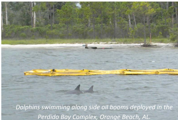
Dolphins swimming along side oil booms deployed in the Perdido Bay Complex, Orange Beach, AL.

Follow-up monitoring and behavioral observations during future visual health assessments will continue to provide the scientific evidence needed to determine if and when interventions or rescues are warranted. To date, two dolphins have stranded in the Perdido Bay complex since the oil spill began, and neither stranding showed visible signs of oiling. Systematic analytical tests are being conducted on tissue samples from those animals to help determine cause of death. One of the two stranded dolphins was an old male with a history of high-risk interactions with humans ( e.g. , closely approaching vessels; begging; and being fed by people, which is both harmful and illegal). Therefore, its age and risky behavior may have contributed to its death, but it is still too soon to make any conclusions about this case or any other stranded dolphins during the spill time period.