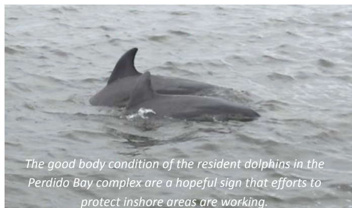
The good body condition of the resident dolphins in the Perdido Bay complex are a hopeful sign that efforts to protect inshore areas are working.