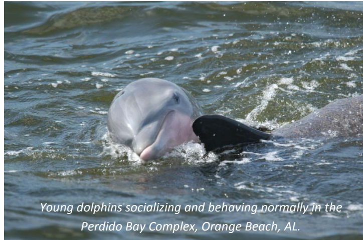
Young dolphins socializing and behaving normally in the Perdido Bay Complex, Orange Beach, AL.

NOAA Fisheries Service's marine mammal biologists and partners are conducting visual health assessments of the resident community of bottlenose dolphins ( Tursiops truncatus ) inhabiting the Perdido Bay complex (Wolf, Perdido, Bay La Launch, and Arnica Bays) near Orange Beach, AL. The purpose of the health assessments is to investigate whether the dolphins are exhibiting any effects from the Deepwater Horizon BP oil spill. These long-term resident dolphins have been the focus of a dedicated eco-tourism industry for almost twenty years and several local dolphin tour captains and citizens have expressed concern about the animals' health and welfare during the oil spill crisis and into the future.